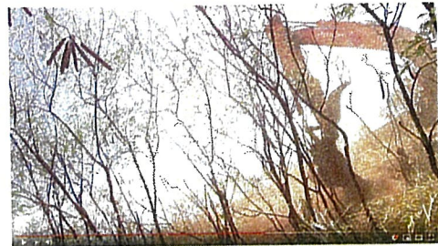
The Taking of Housewife Gulch / Pueo Country

https://www.youtube.com/watch?v=QoE1bdaqUvg