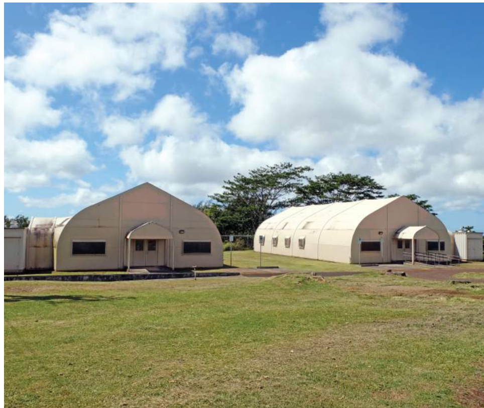
31. View of WCF-07 and WCF-08