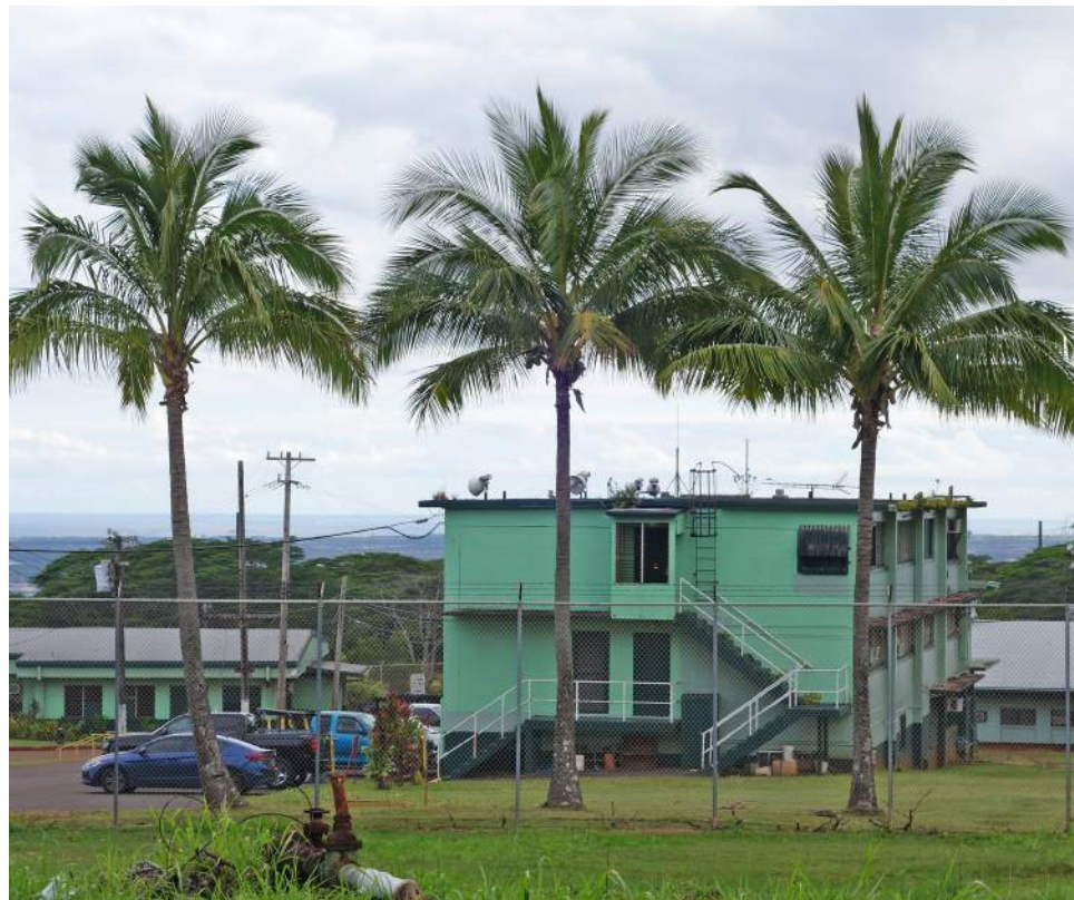
22. Side view of WCF-C and parking