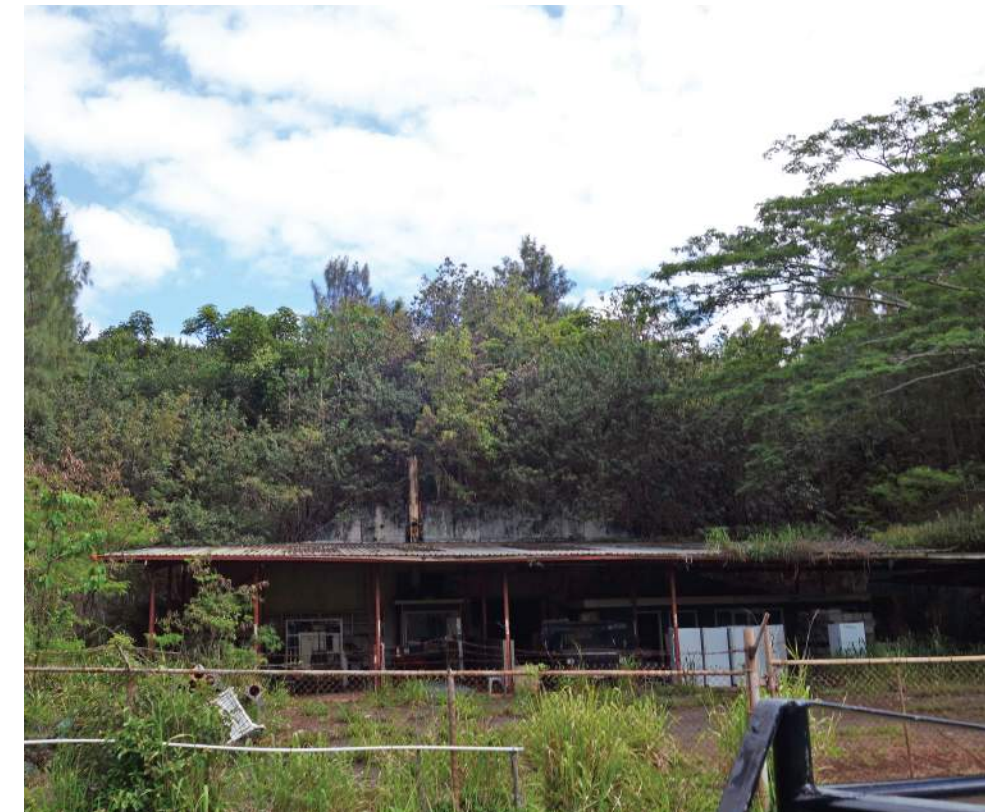
33. View of underground concrete tunnel