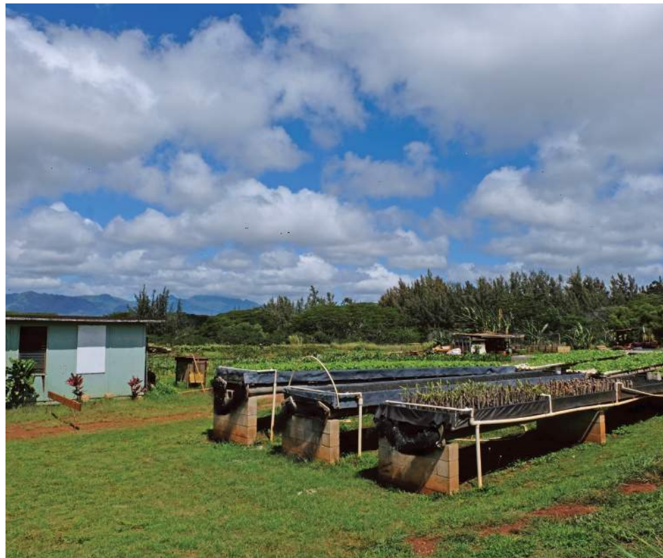
7. View of 8-acre farm