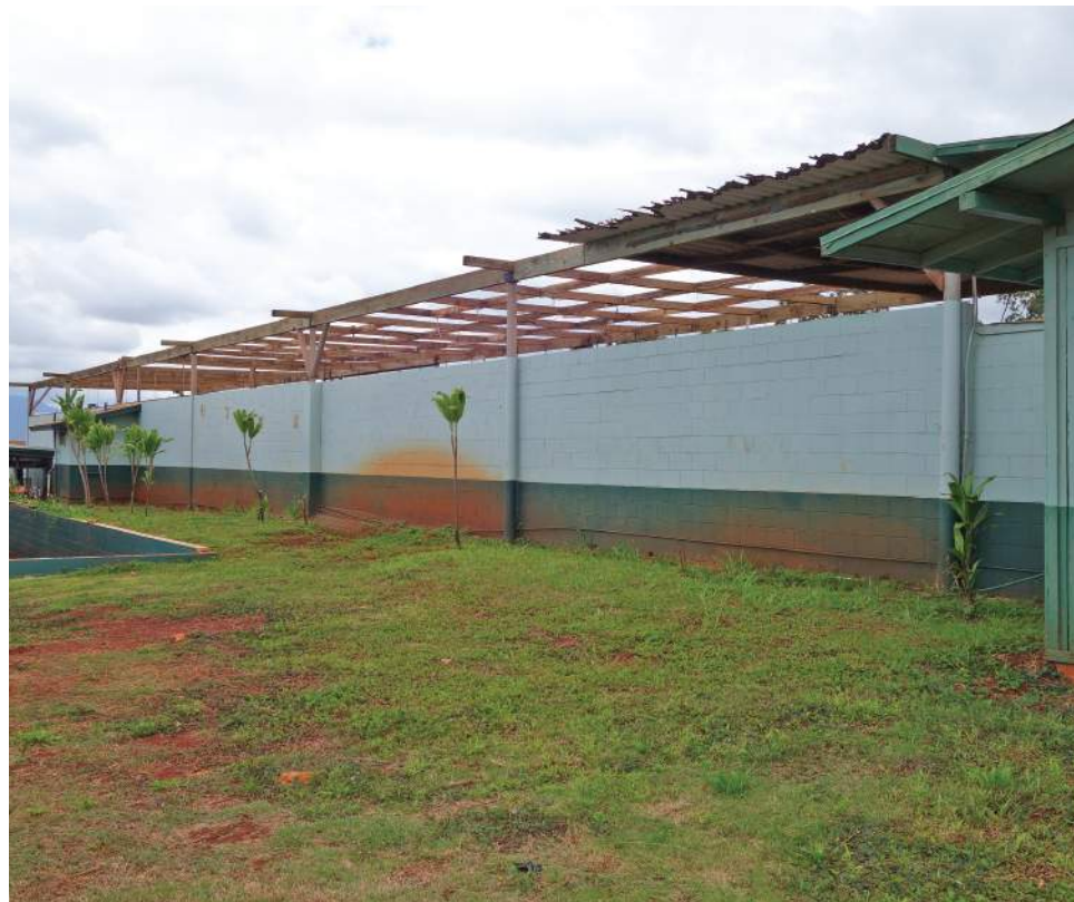
16. Looking towards WCF-I