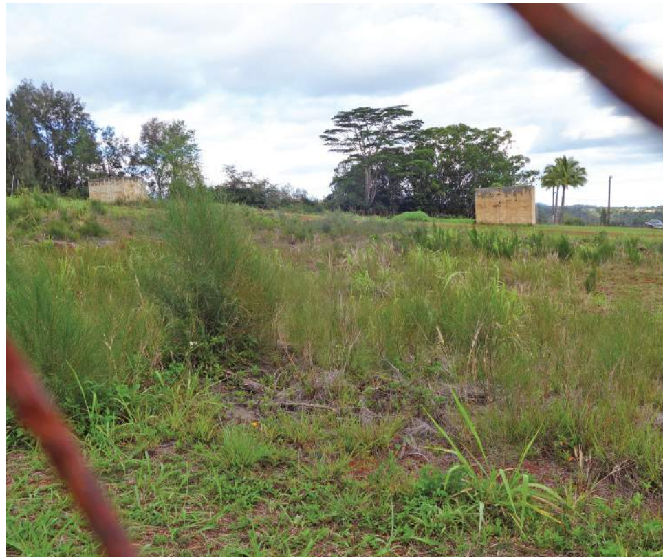
4. Looking towards splinter proof concrete cable huts formerly used by the military for telecommunications