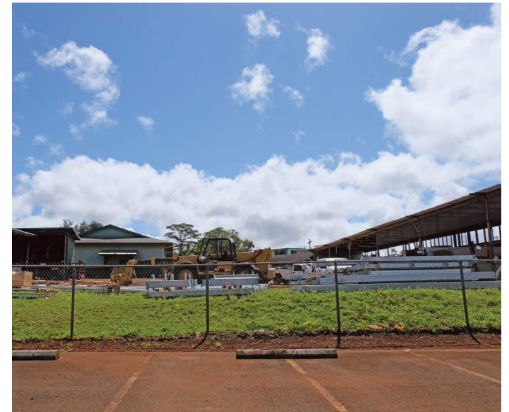
12. Looking towards WCF-S1, WCF-CP and WCF-I