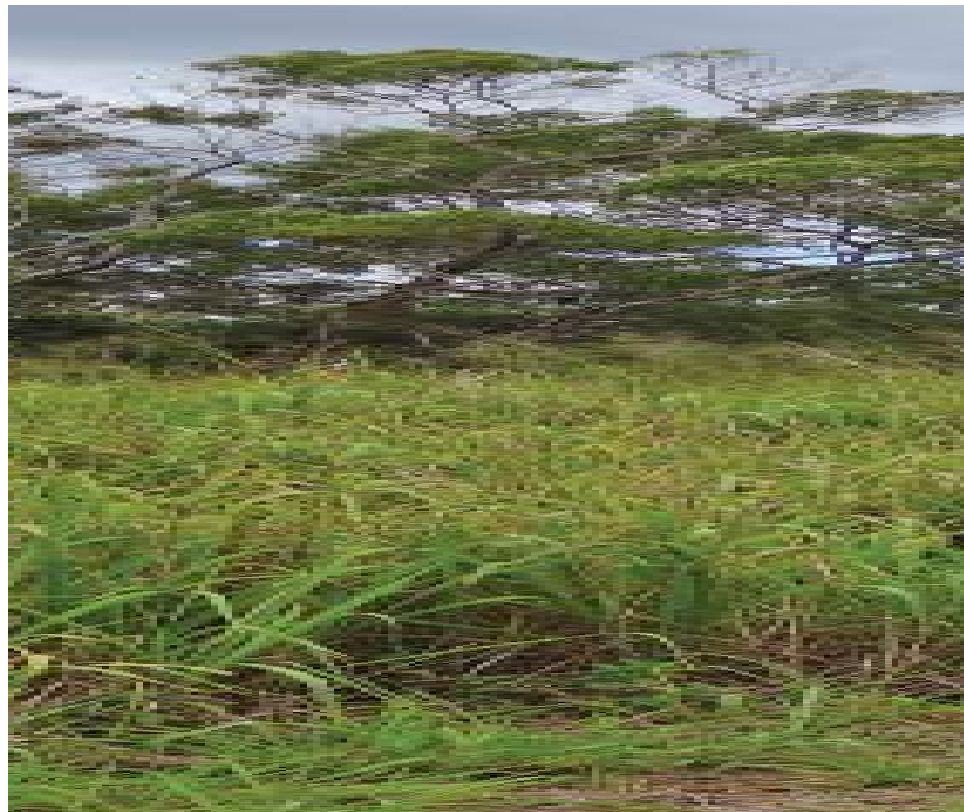
1. Looking towards north-west boundary