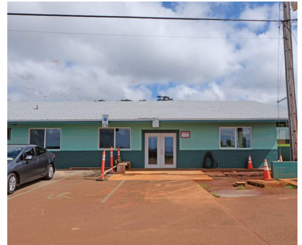
15. Front view of WCF-A