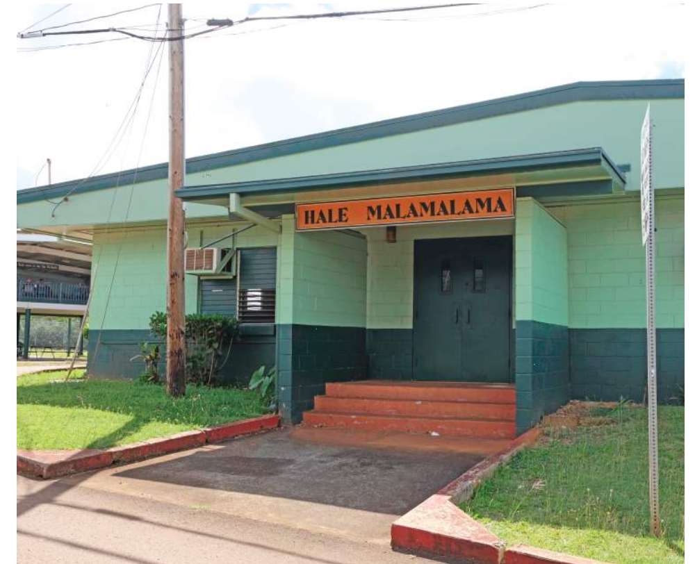
21. Front view of WCF-E