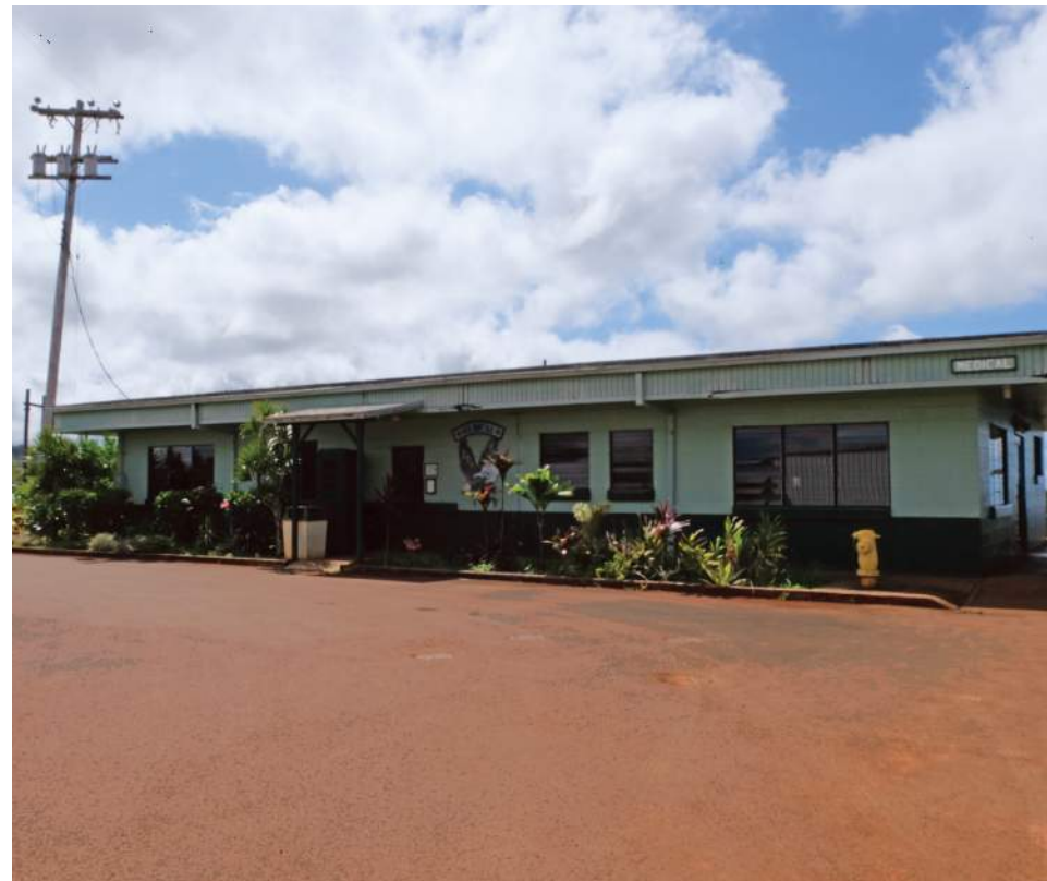
23. Front view of WCF-M