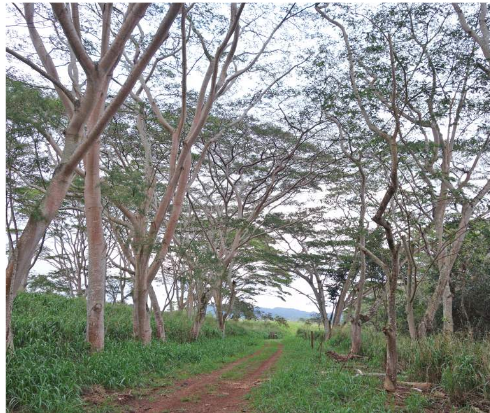
35. View along southern boundary