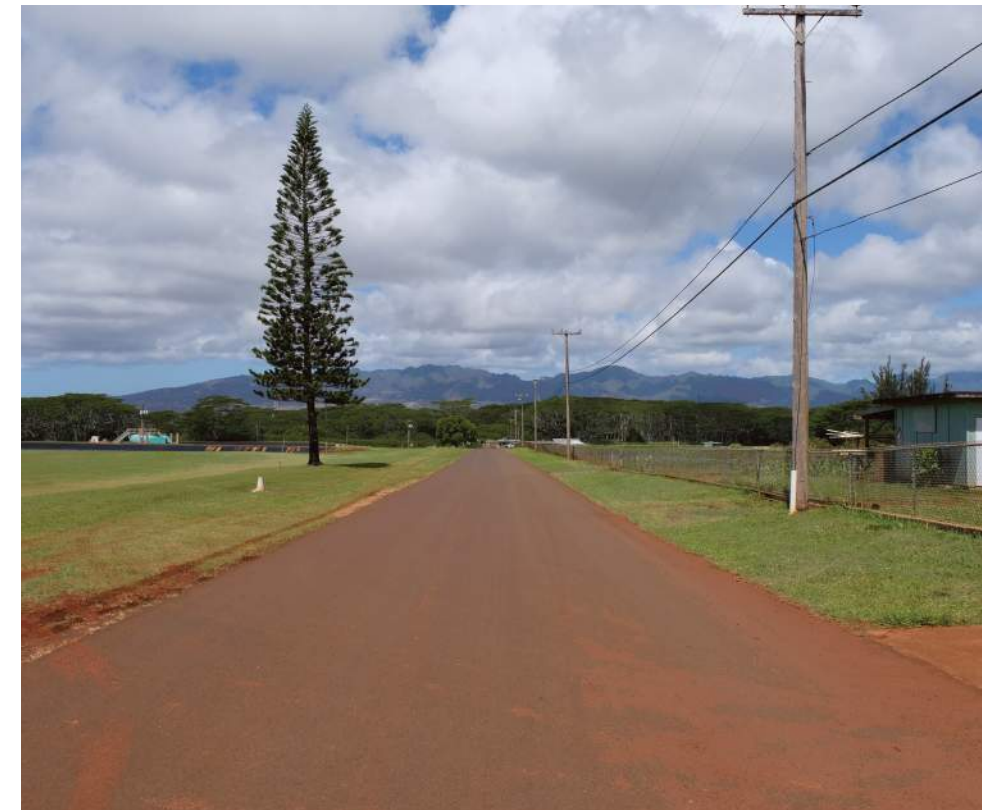
6. Looking down Waiawa Prison Rd towards entrance