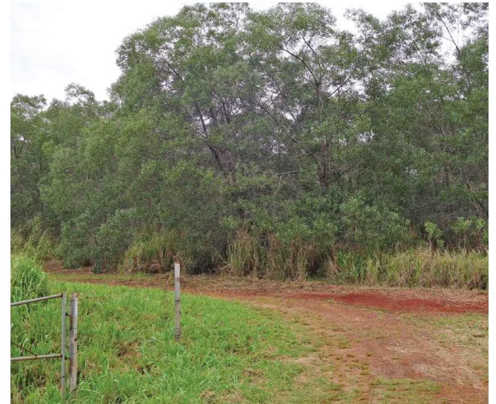
3. Looking towards northern boundary