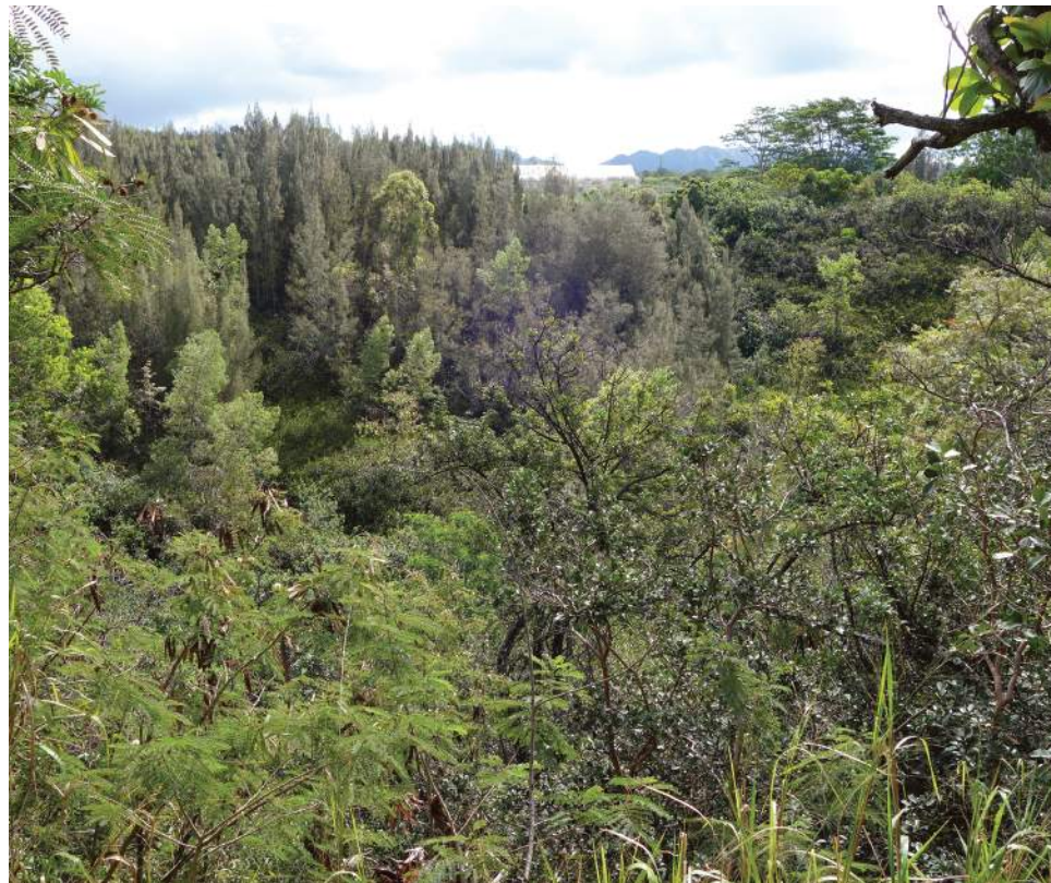
34. View of dense vegetation below concrete tunnel