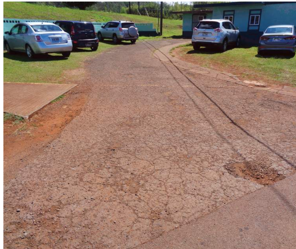
29. View of WCF-01 parking