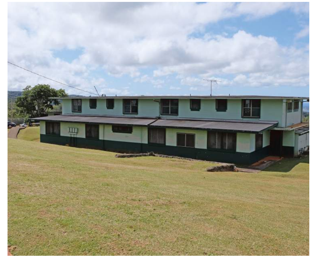
27. View of WCF-04