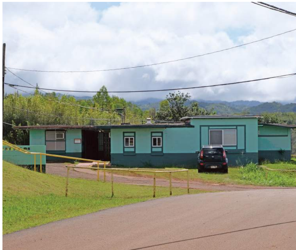
25. View of WCF-01