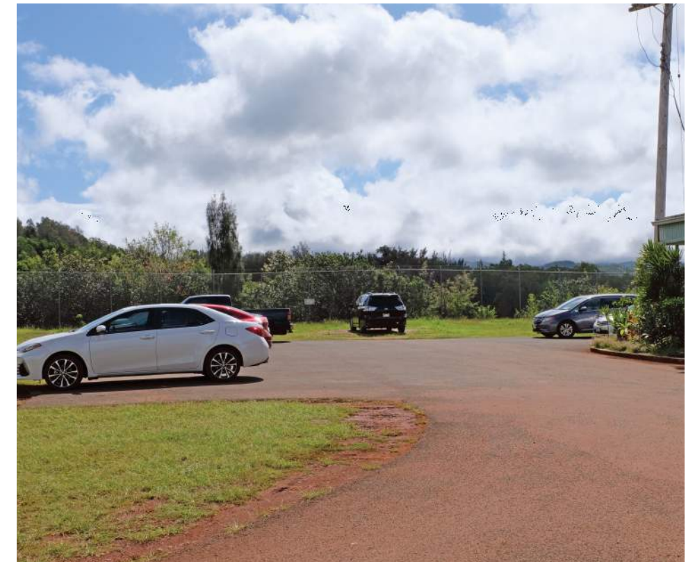
24. View of WCF-M parking