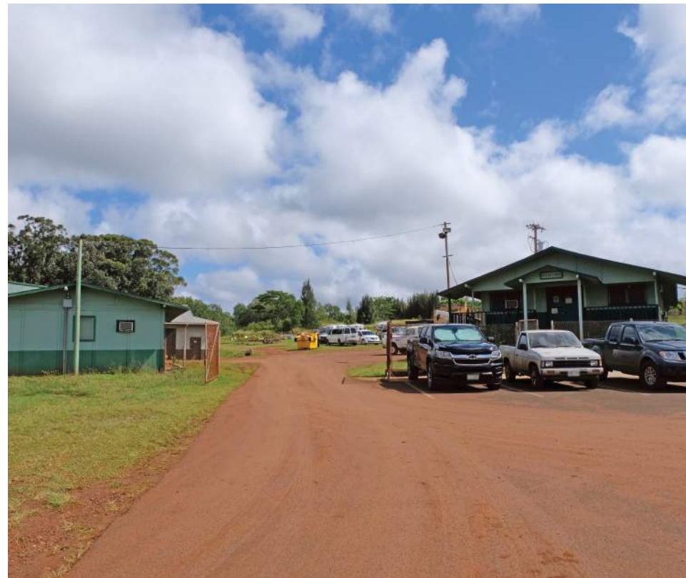
17. Looking towards WCF-B and parking