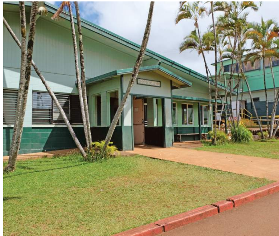
20. Front view of WCF-F