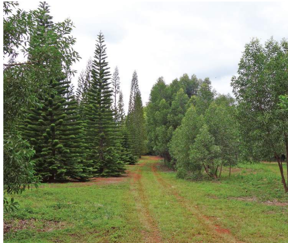
2. Looking toward northern landscaped area