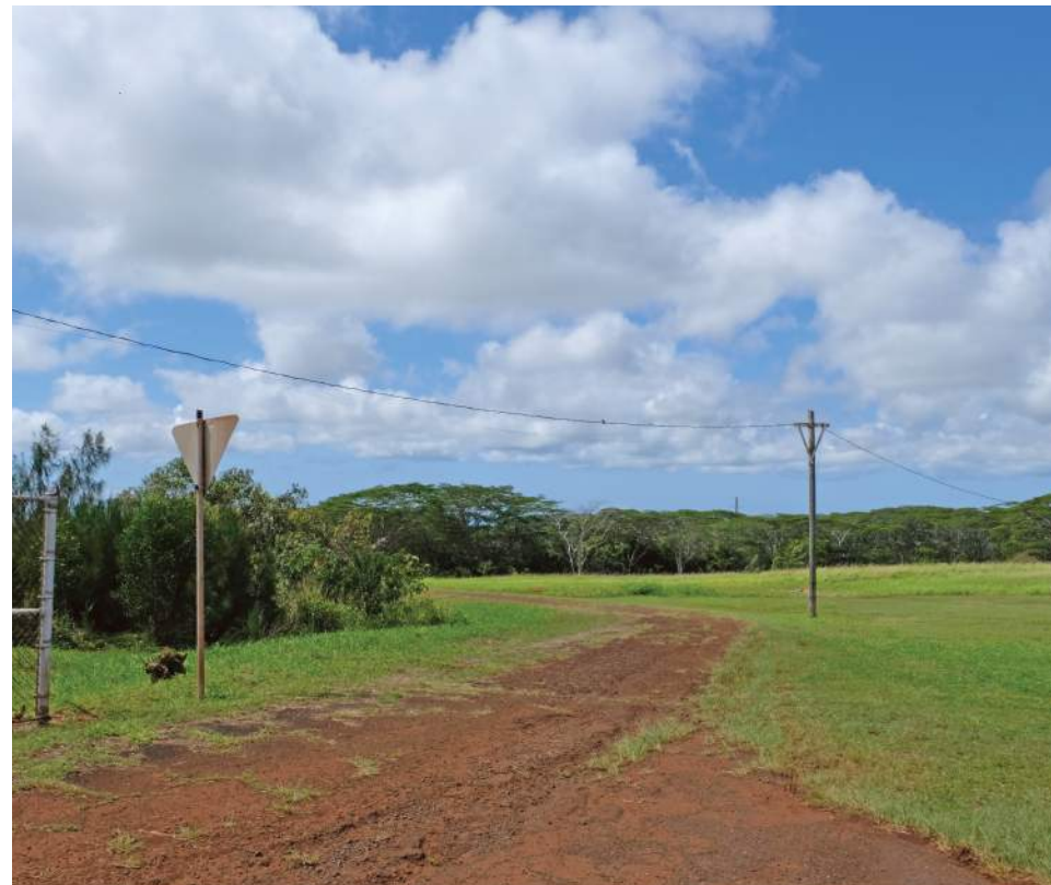
11. Looking towards southern boundary