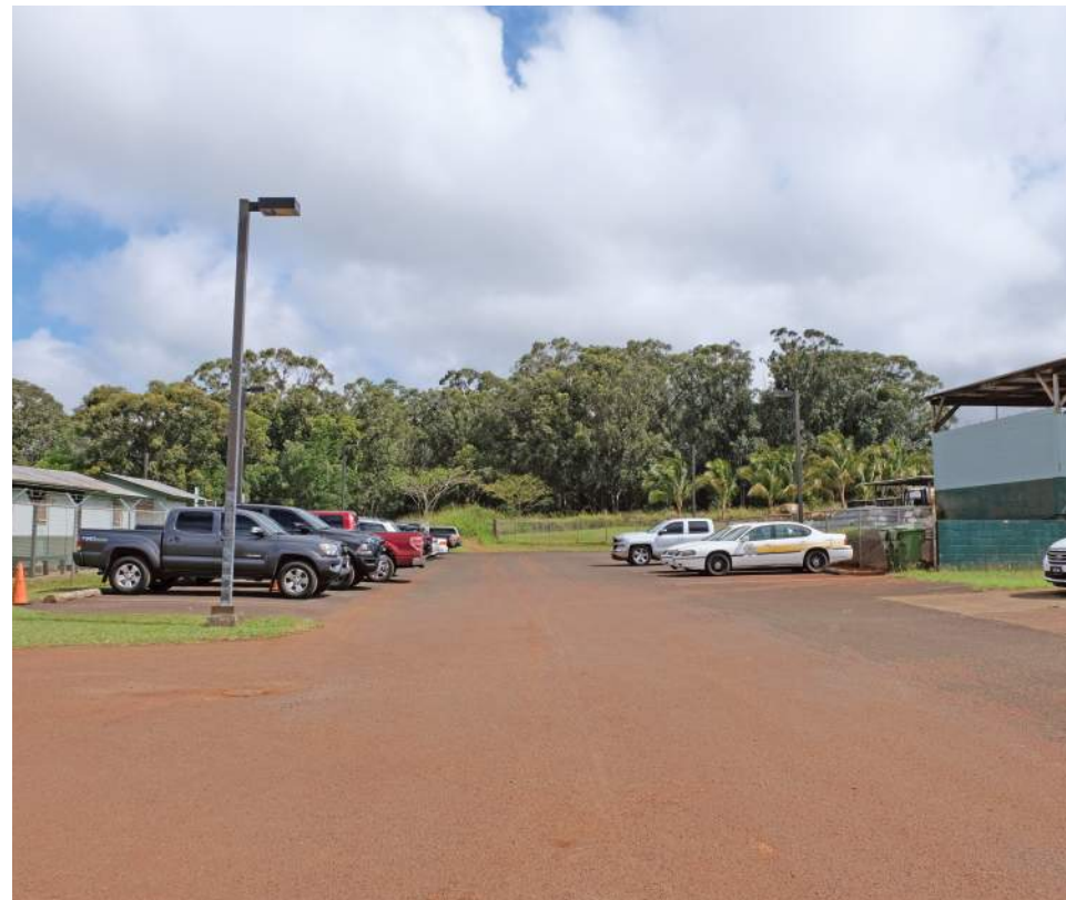
14. Looking towards WCF-K parking