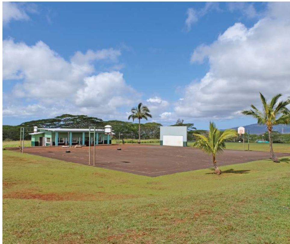
10. View of WCF-R