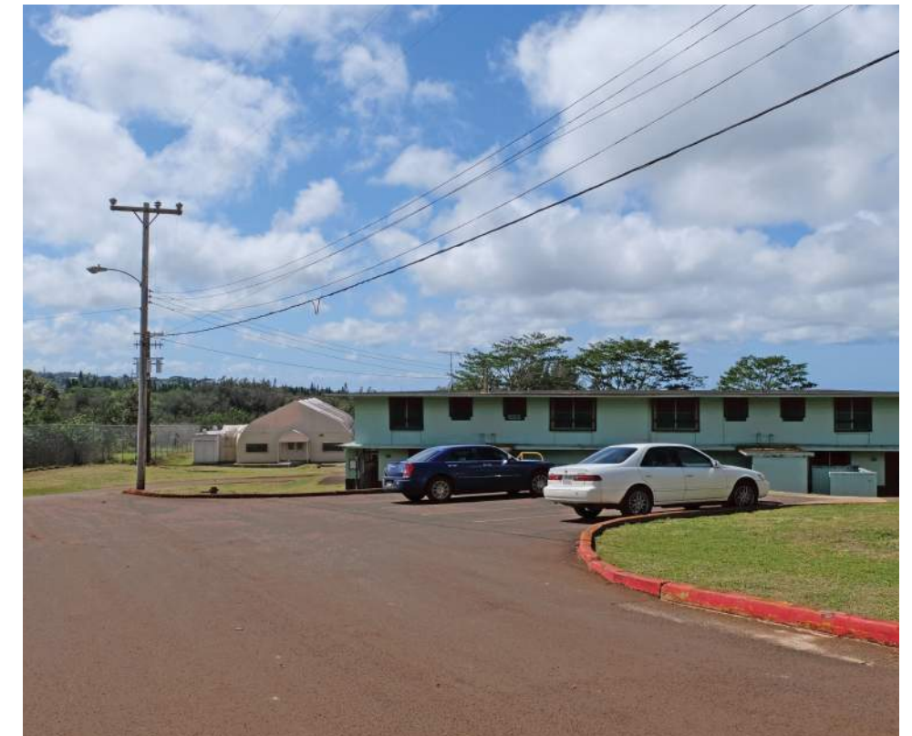
30. View of parking for WCF-05 and WCF-06