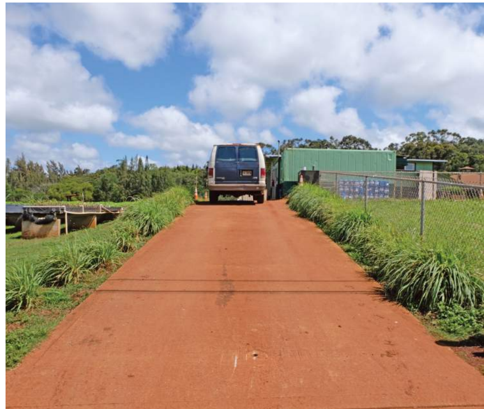
8. Driveway leading to agricultural structures and farm