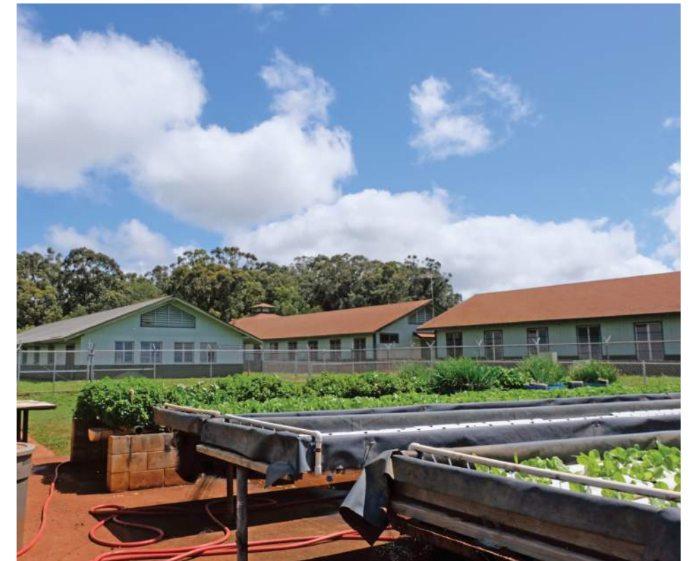
9. View of hydroponics plants and rear-side of WCF-P, WCF-09 and WCF-10