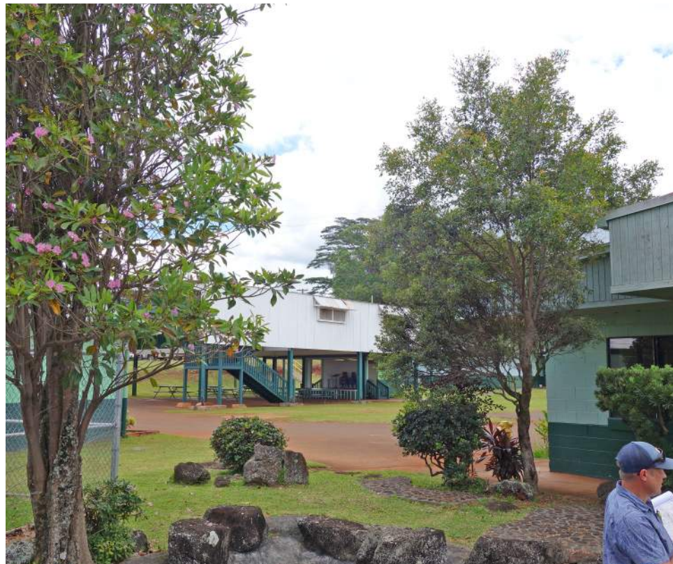
28. View of WCF-PA