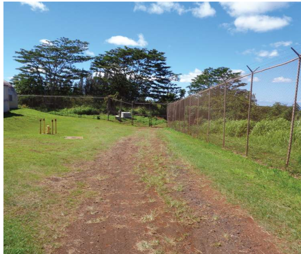
32. View of southern boundary