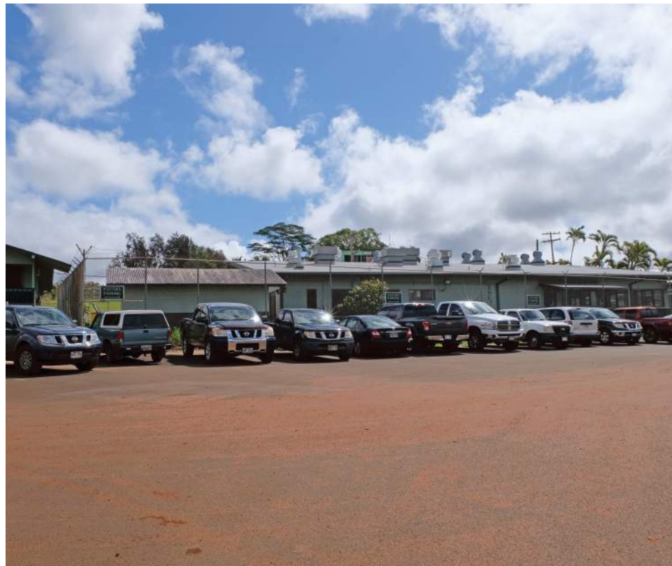
19. Side view of WCF-F and parking