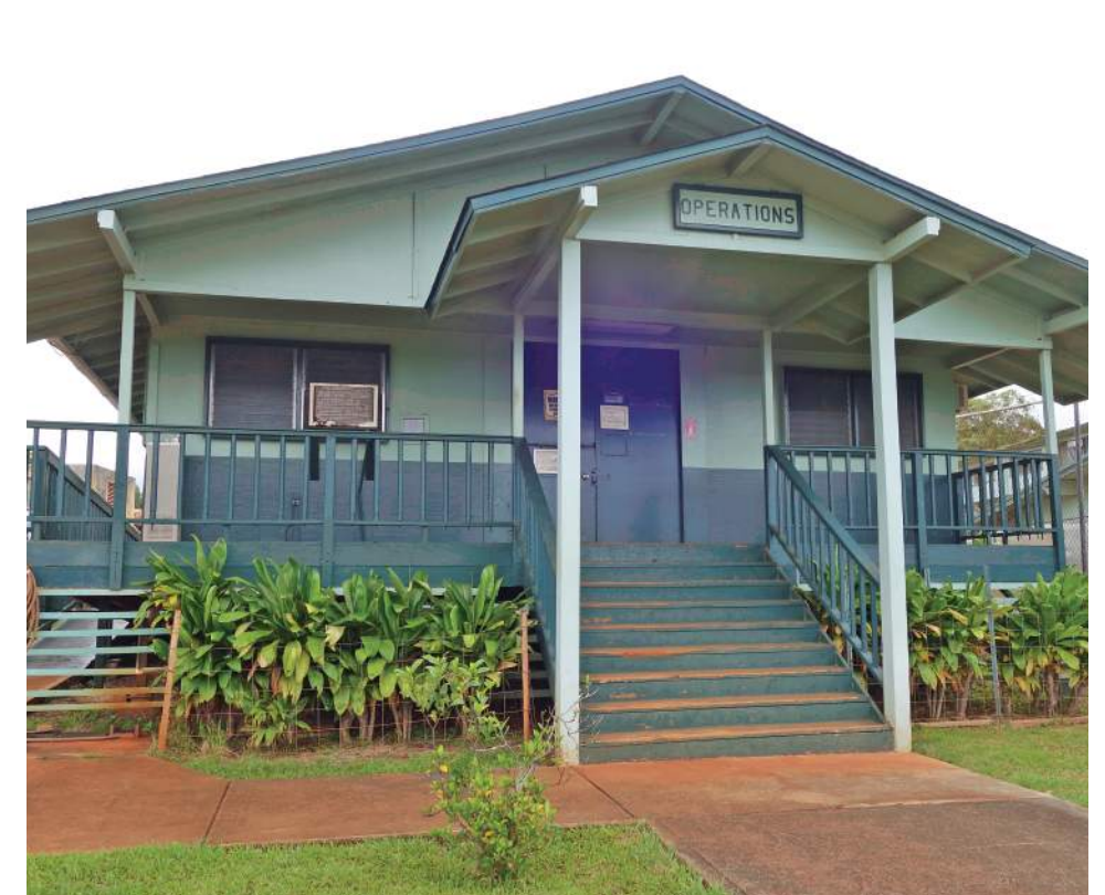
18. Front view of WCF-B