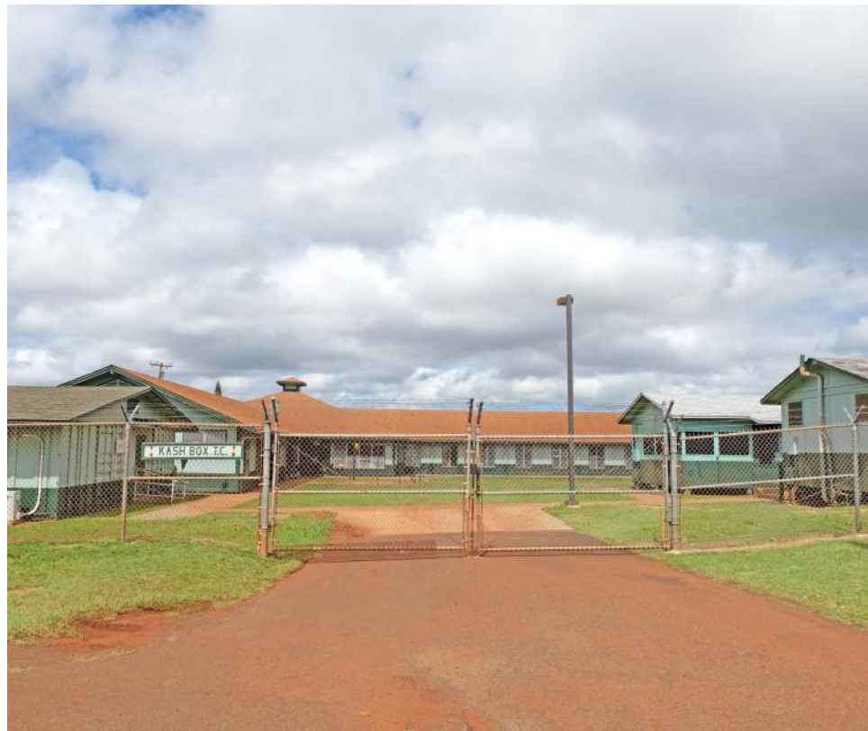
13. Looking towards WCF-V1, WCF-09 and WCF-K