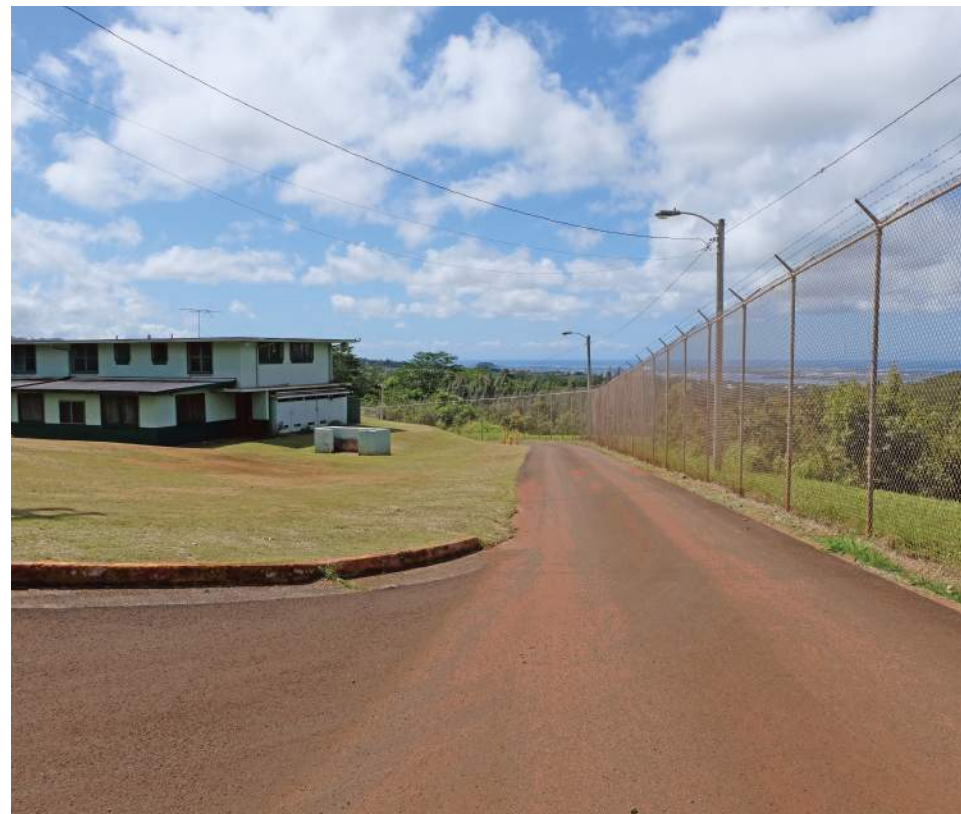
26. View of road leading to WCF-07 and WCF-08, and the southern boundary