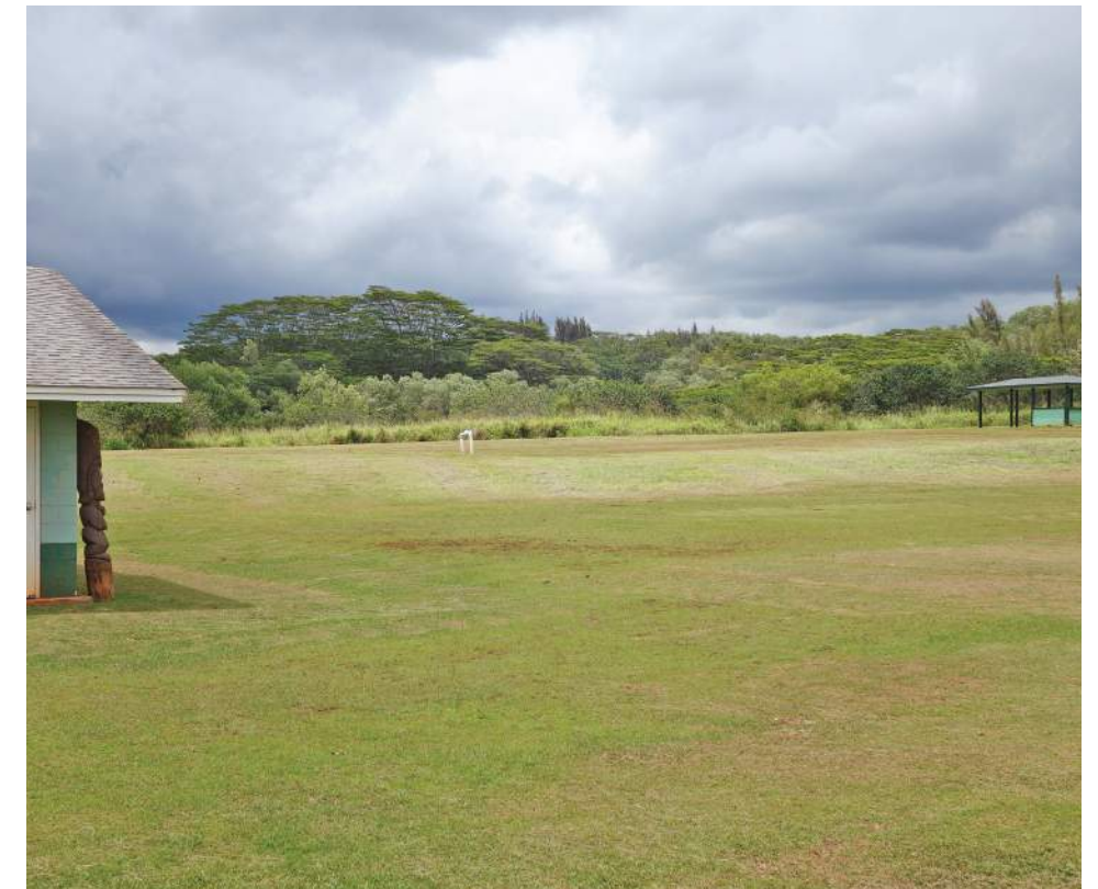
36. View towards northern boundary