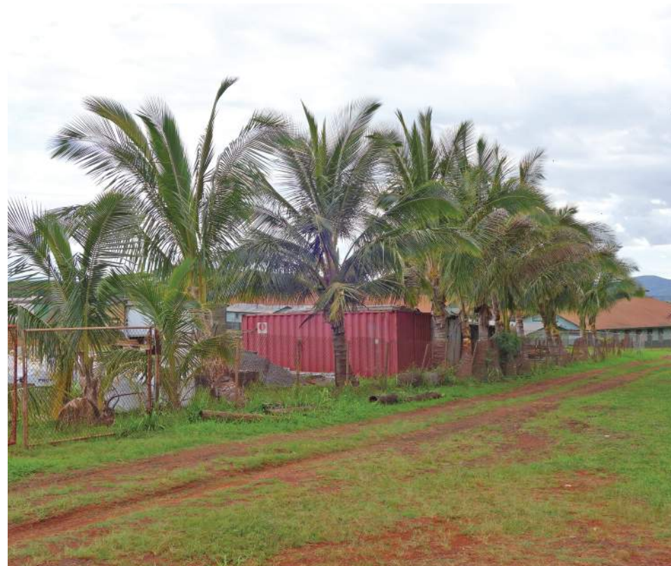
5. Storage containers