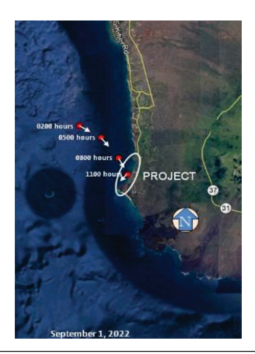
Figure 2. Approximated current flow off Mākena coast during morning hours (0200 to 1100 hours) of September 1, 2022 (PacIOOS, 2022).

Using the PacIOOS Regional Ocean Modeling System (ROMS) we can display approximated water current movements off the southwestern coast of East Maui that occurred just prior to and during our September 1, 2022 sampling event (Figure 2). Water flows were moving into the Mākena vicinity from the northwest before and during this sampling event.