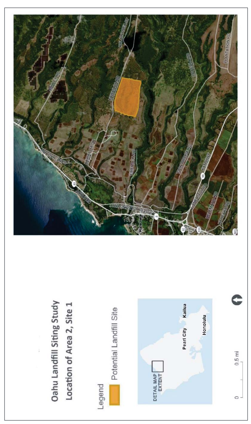
Figure 4.9 Location of Area 2, Site 1