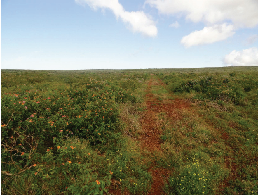
Figure 2. View west showing the Guinea grass and lantana shrubland characteristic of western portion of the project area in Miki Basin