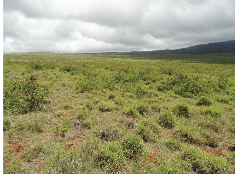
Figure 3. View northeast across the Pālāwai Basin portion of the project area showing a guinea grass and lantana shrubland