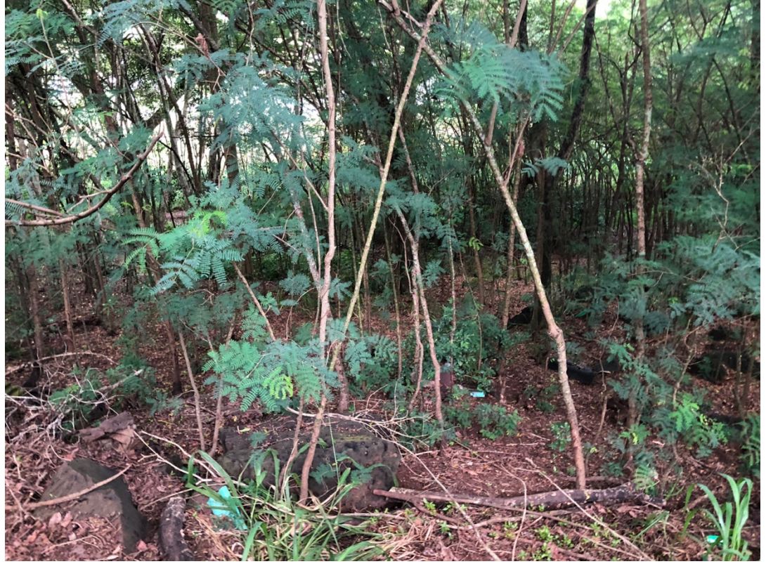
Figure 2. Koa haole forest with open understory of tree canopy along slope of project area.

Figure 1. West side of Kealia Road with thicket of trees along project area.