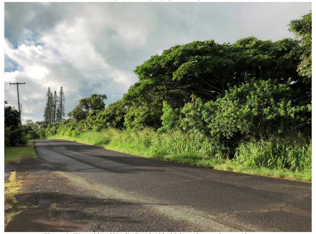
Figure 1. West side of Kealia Road with thicket of trees along project area.