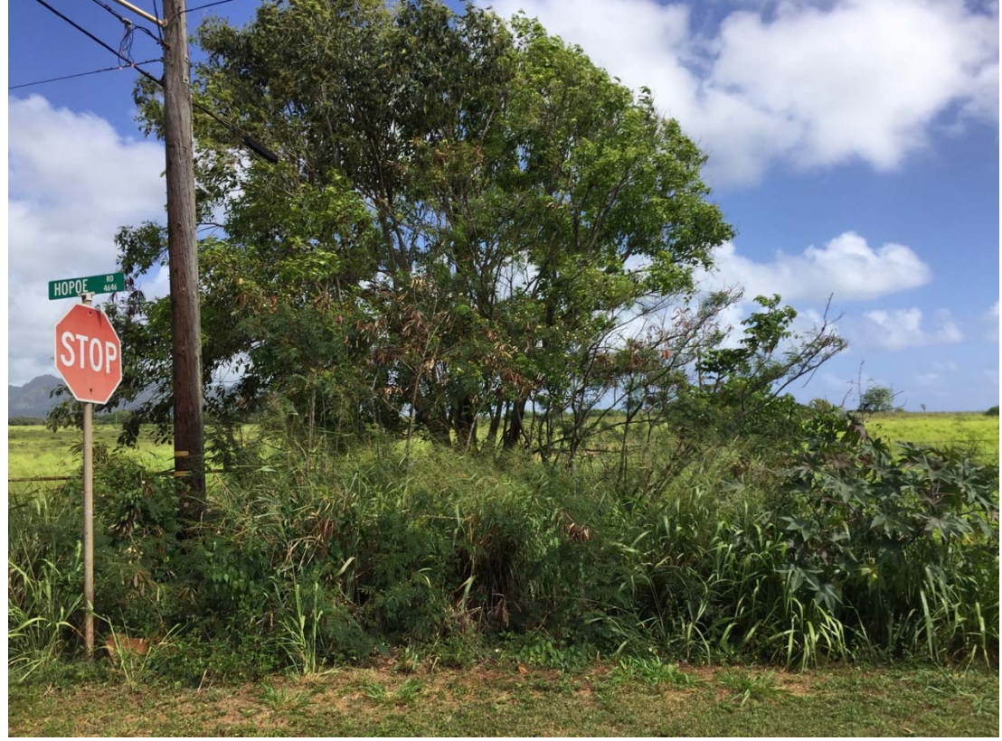
Figure 2. A small stand of Java plum trees with other weedy species at southwest corner of property.

Figure 1. View of property looking west from eastern boundary, Guinea grassland.