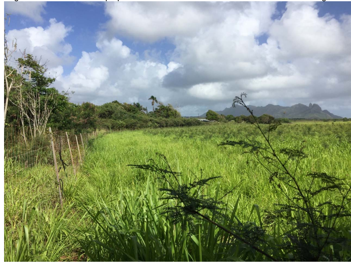
Figure 4. Southern boundary along existing residential subdivision.

Figure 3. General area for proposed roundabout to connect new subdivision to existing road.