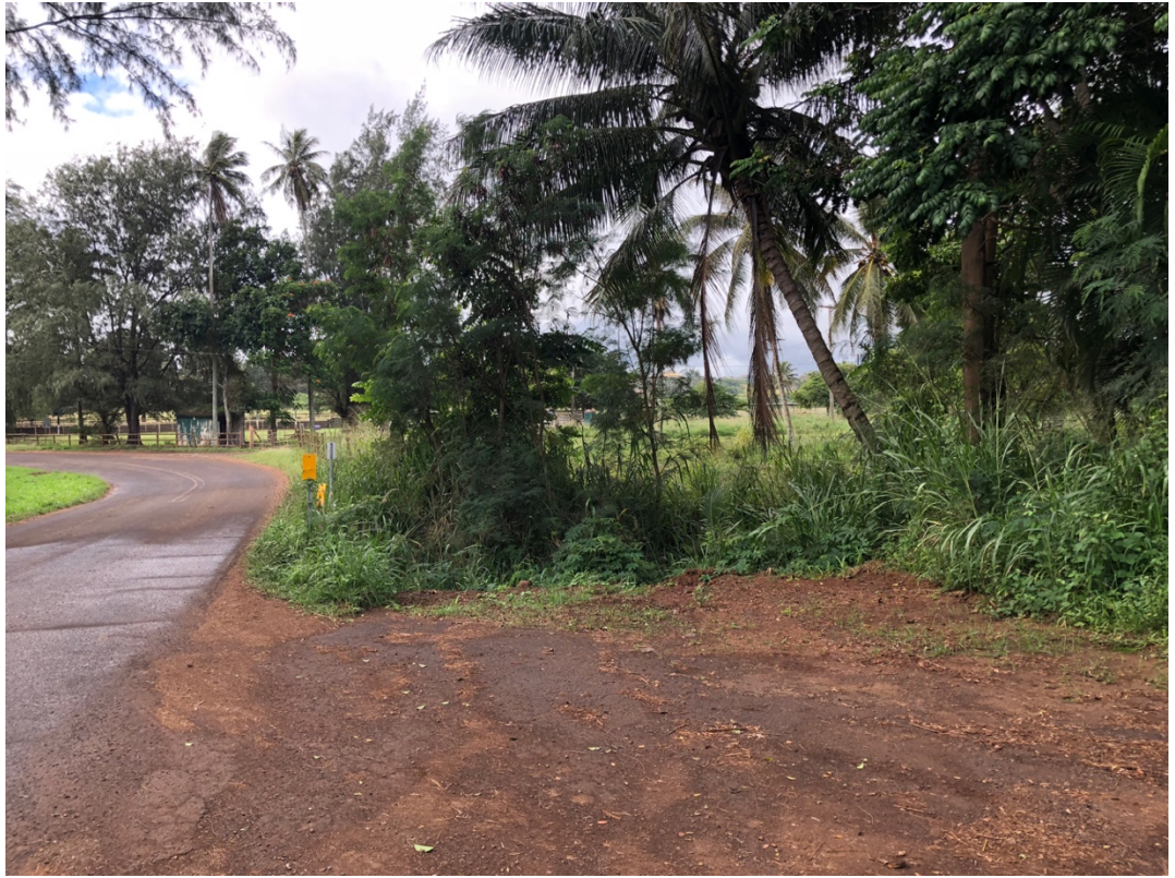
Figure 3. Near Kealia farm with drainage in foreground.