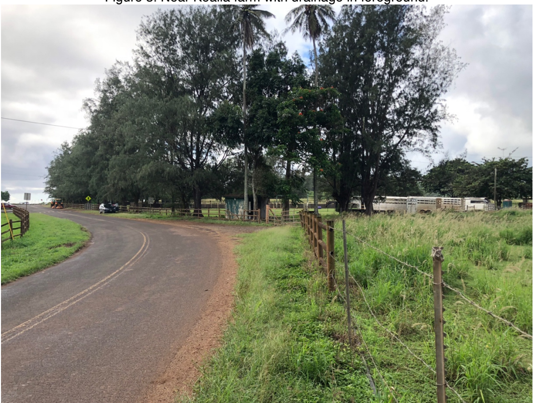
Figure 4. Kealia Farm with ironwoods lining roadway.

Figure 3. Near Kealia farm with drainage in foreground.