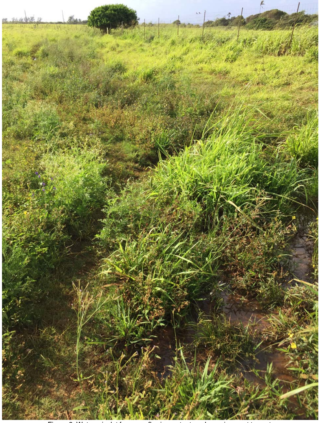
Figure 6. Watery rivulet from overflowing water trough running west to east.