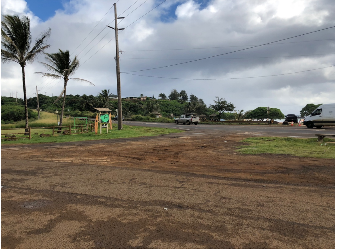
Figure 6. Roundabout area at junction of Kealia Road and Kuhio Highway.

Figure 5. Thicket of Hala, naio, naupaka, and buttonweed.