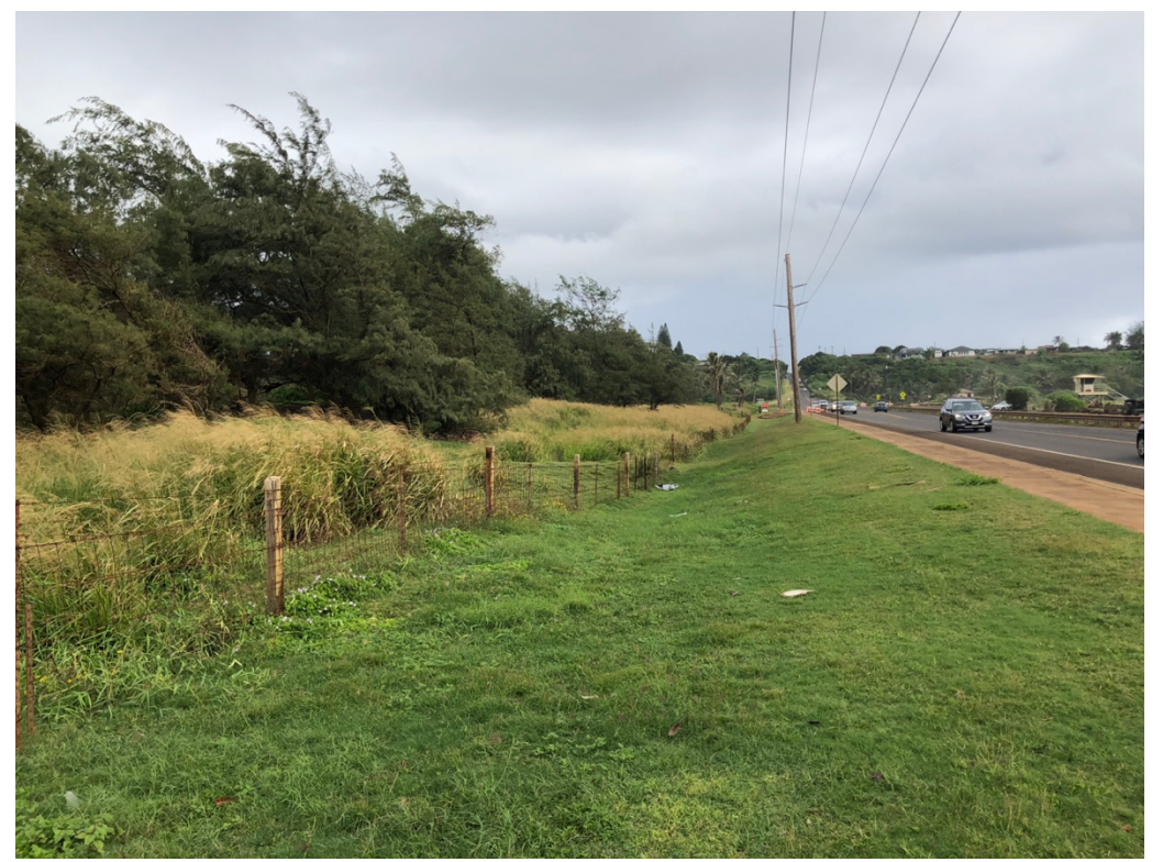
Figure 7. Mauka project area along Kuhio Highway characterized by ironwood stands and Guinea grass.