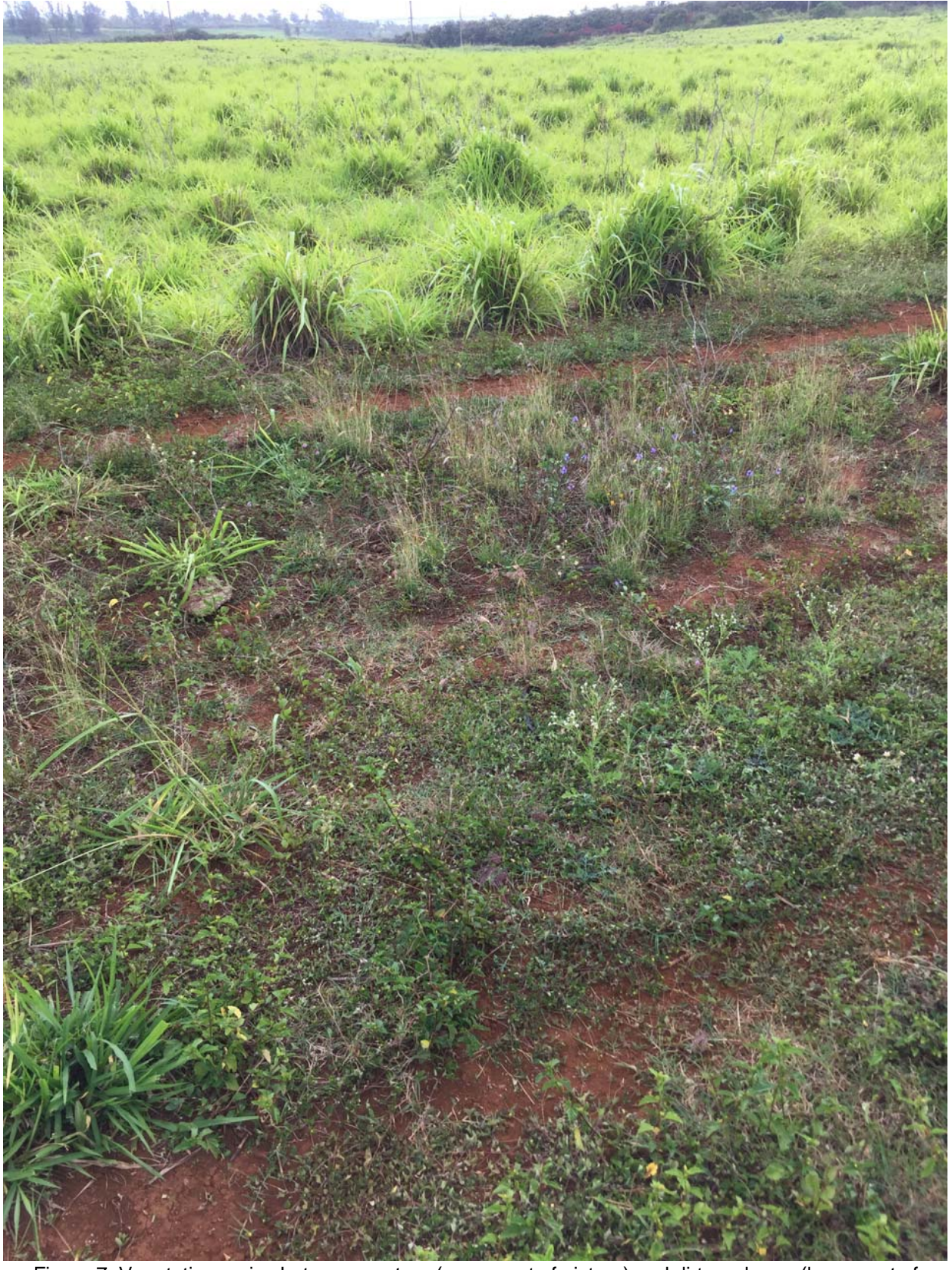
Figure 7. Vegetation varies between pasture (upper part of picture) and dirt roadways (lower part of picture)