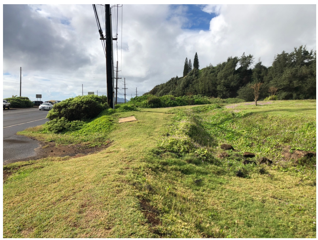
Figure 8. At southern end of project area near Kaiaka Fire Station and existing manhole.