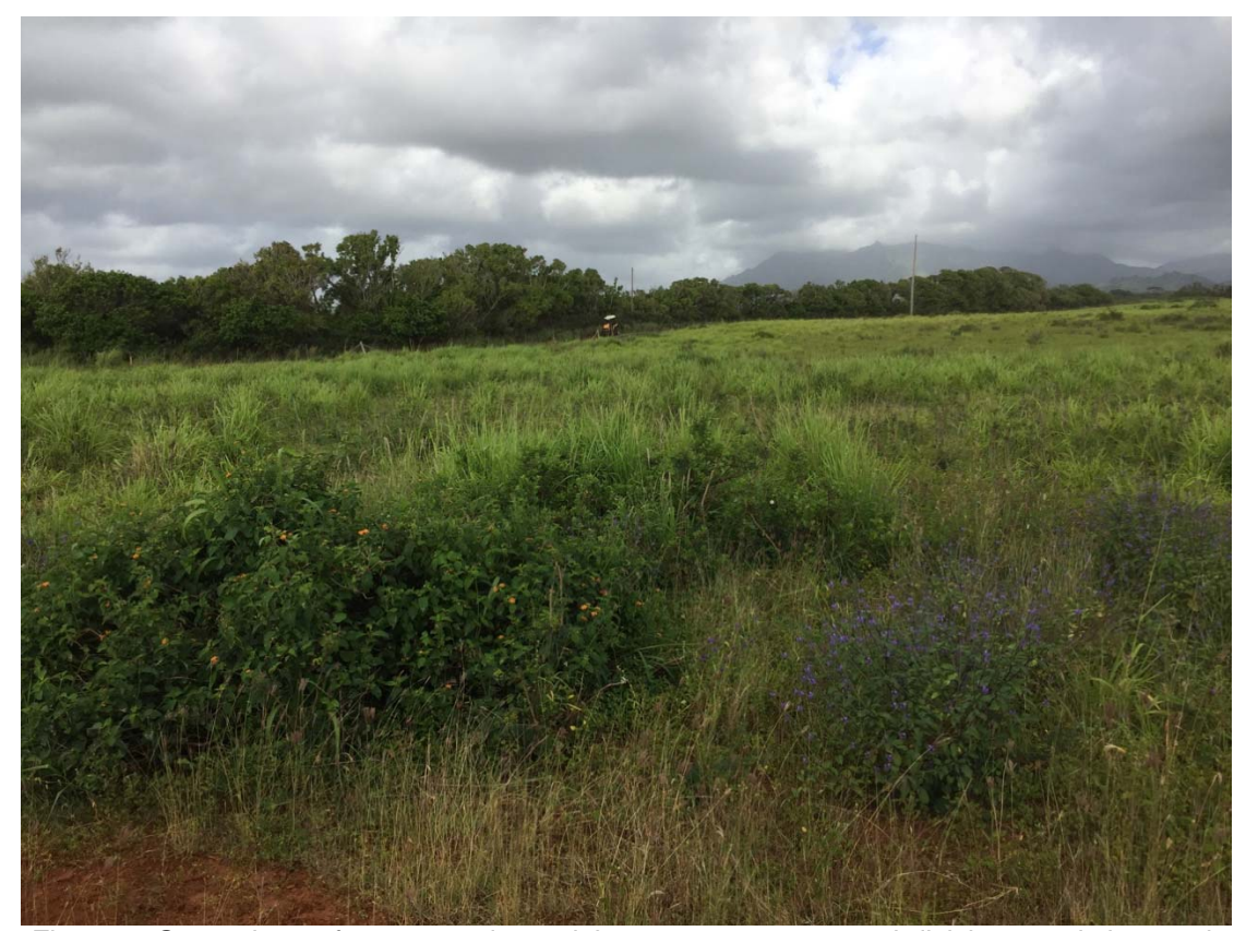
Figure 3. General area for proposed roundabout to connect new subdivision to existing road.