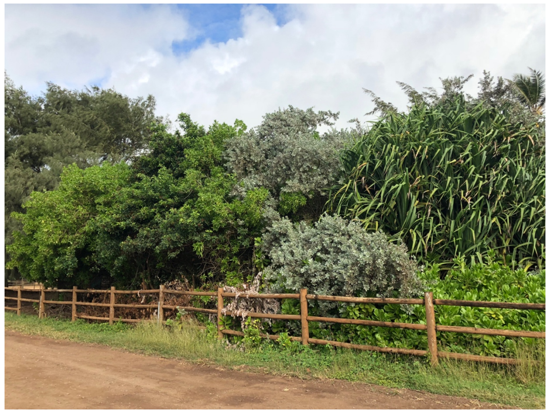
Figure 5. Thicket of Hala, naio, naupaka, and buttonweed.