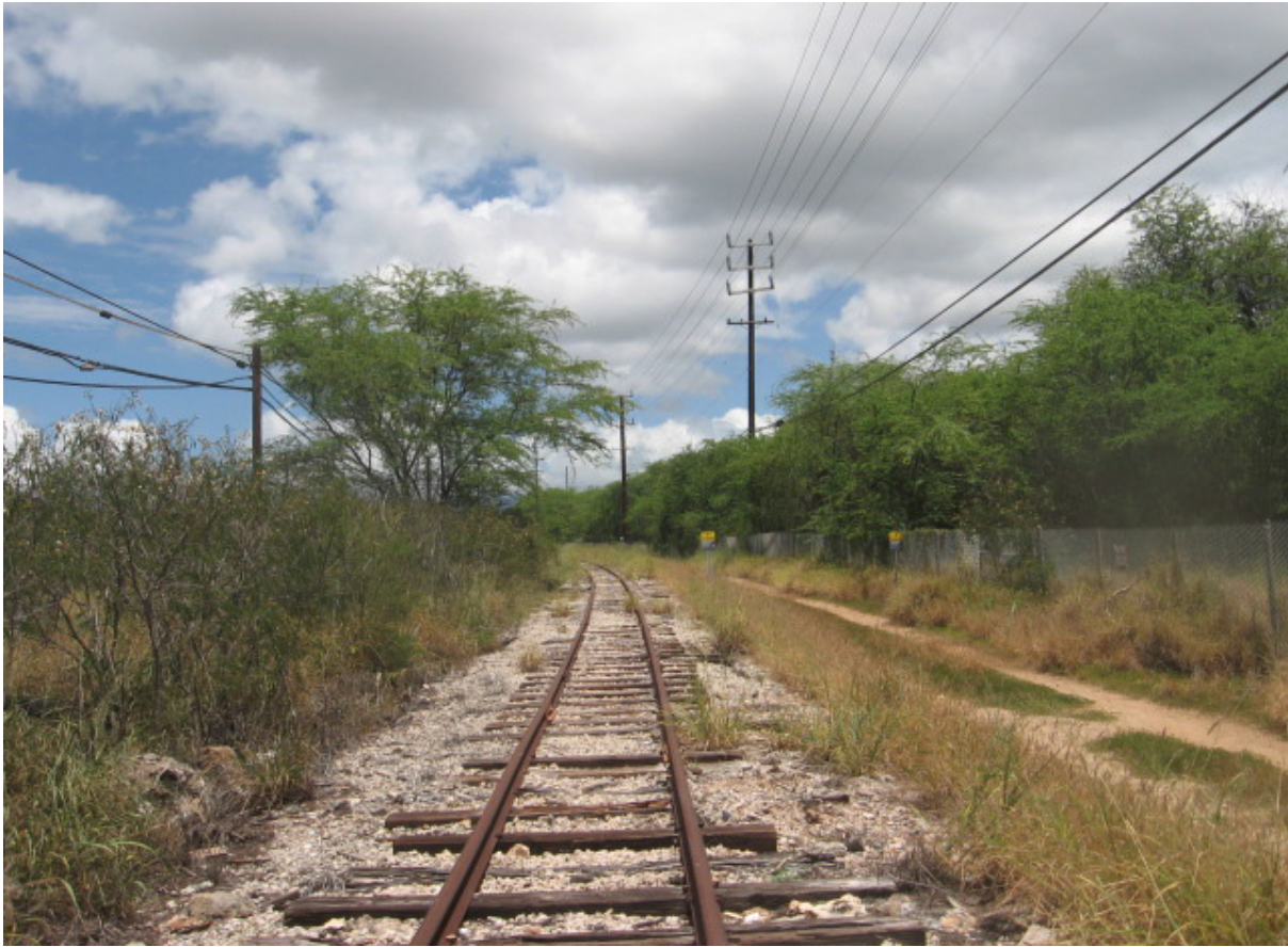
Figure D.2 Photos