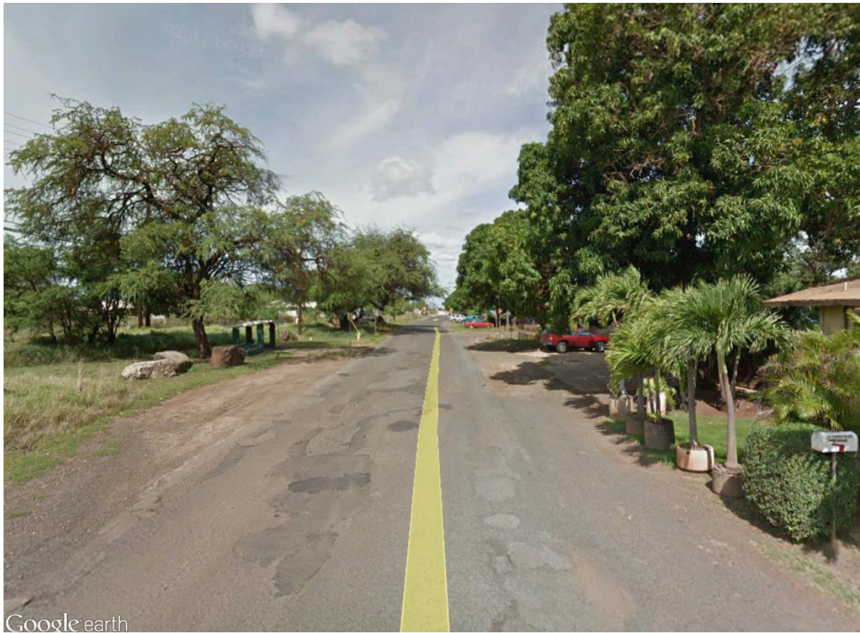
Figure D.2 Photos