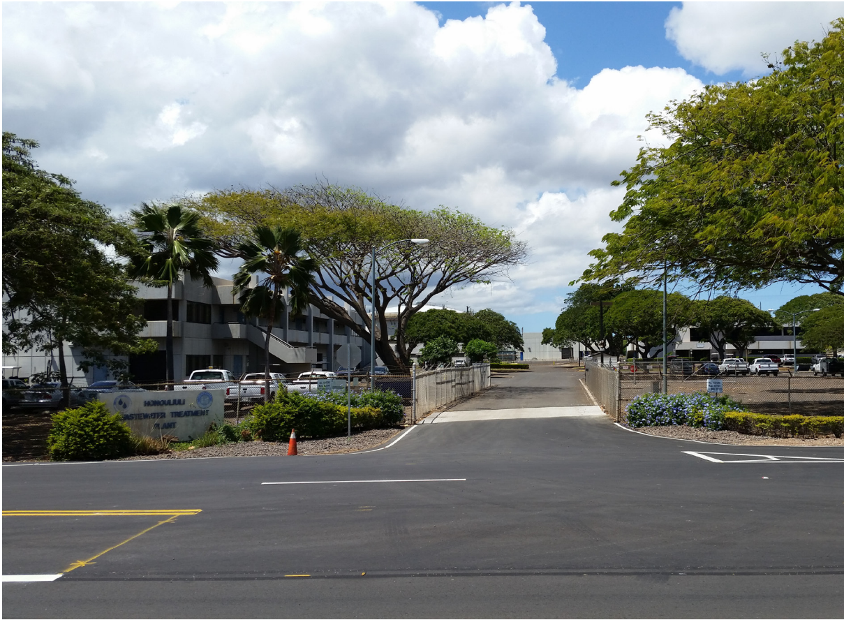
Figure D.2 Photos