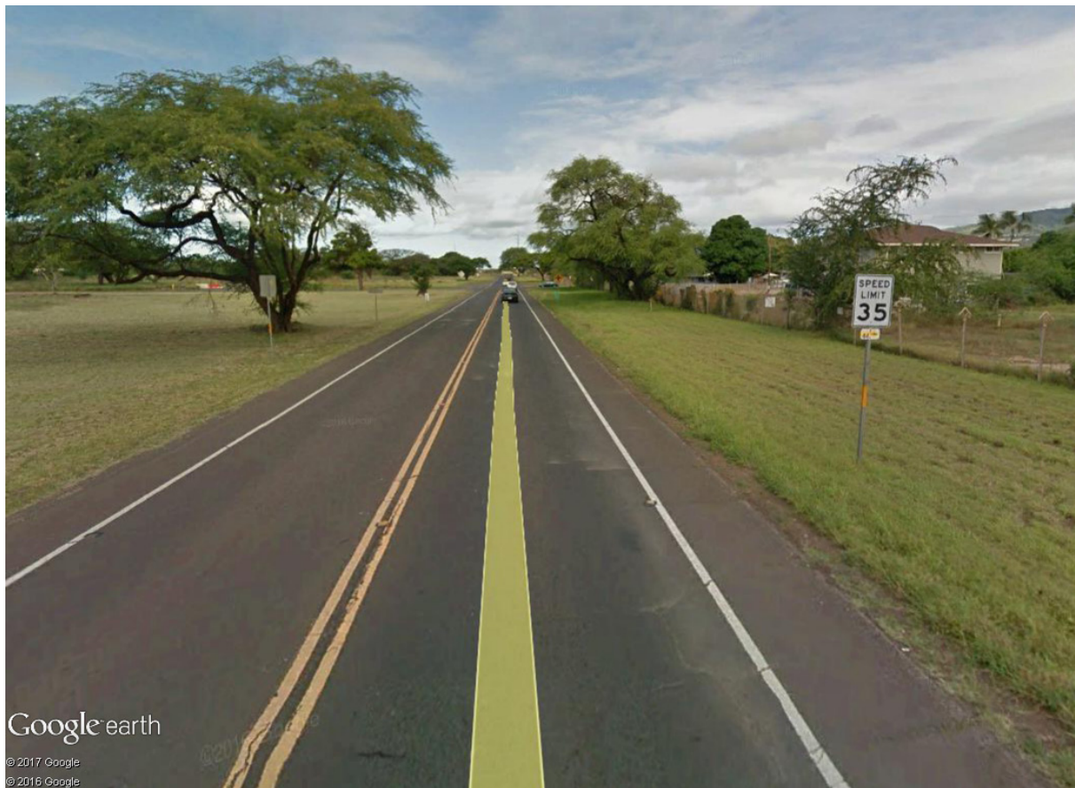
Figure D.2 Photos