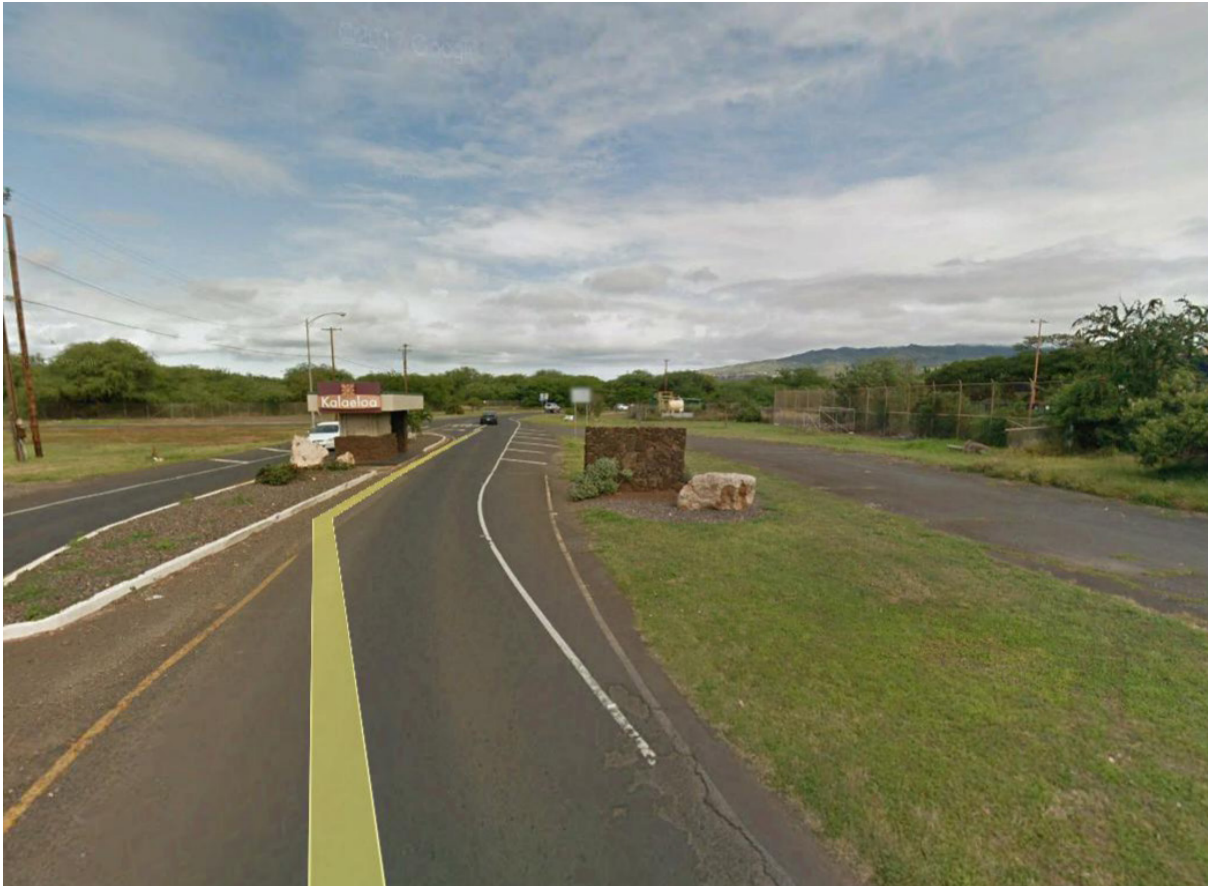
Figure D.2 Photos