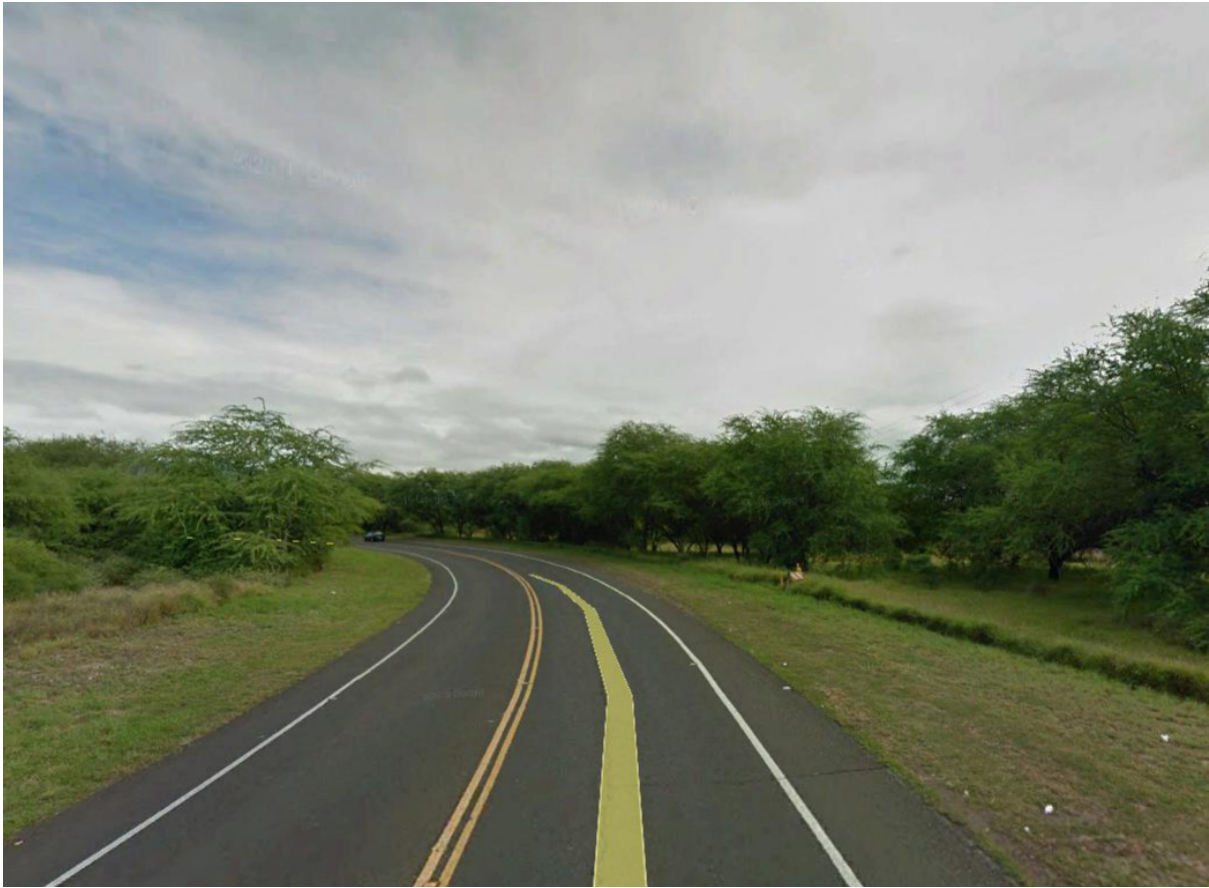
Figure D.2 Photos