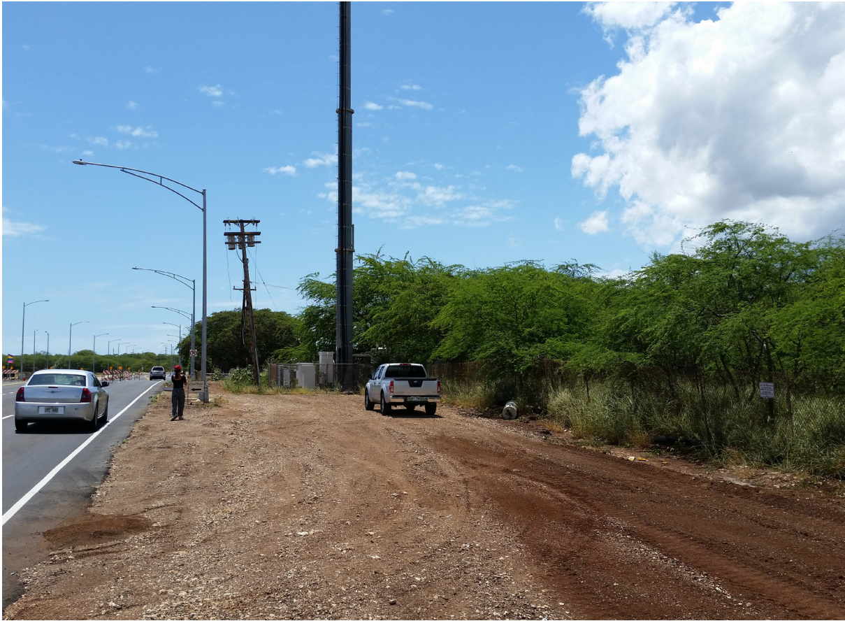
Figure D.2 Photos