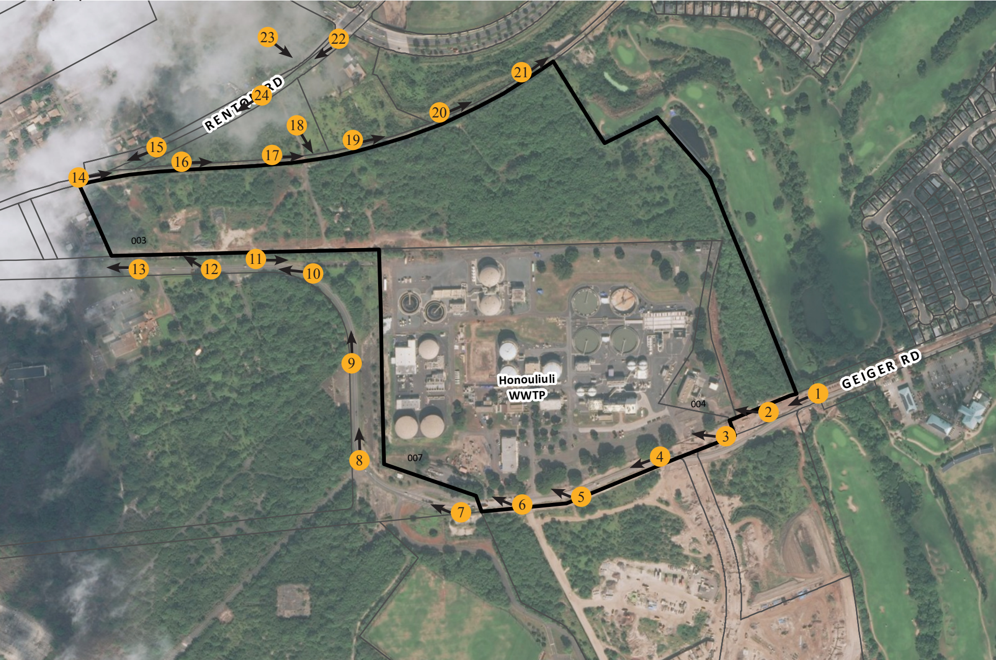
Figure D.1 Photo Key Map