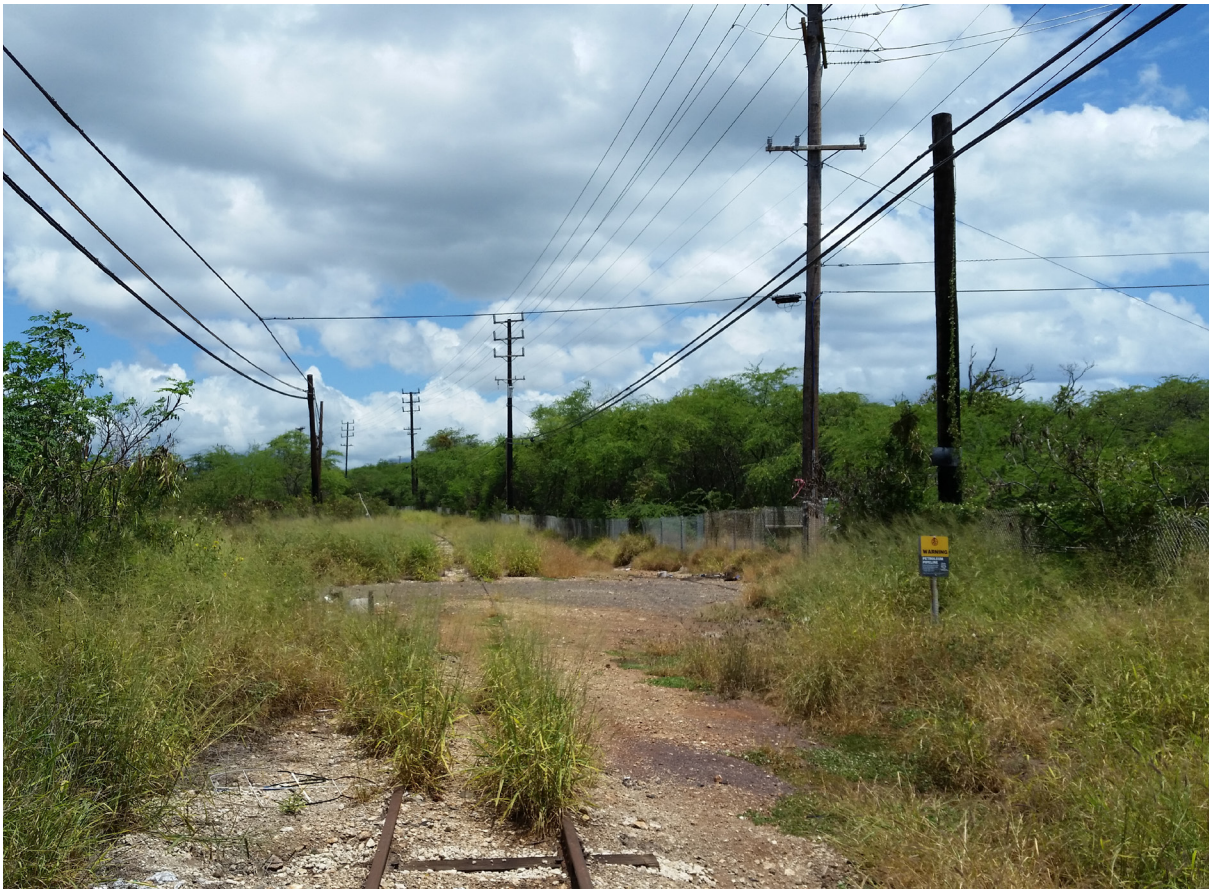
Figure D.2 Photos