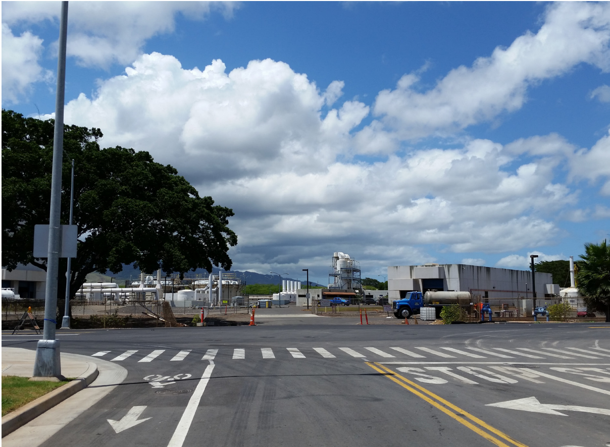
Figure D.2 Photos