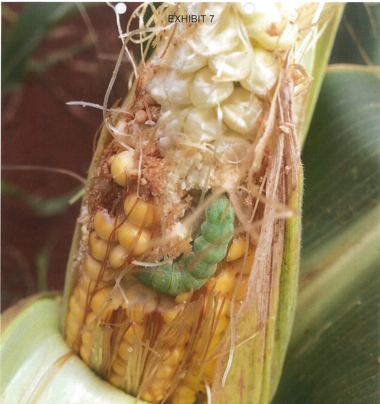
Photo of a corn earworm at our Kunia farm.