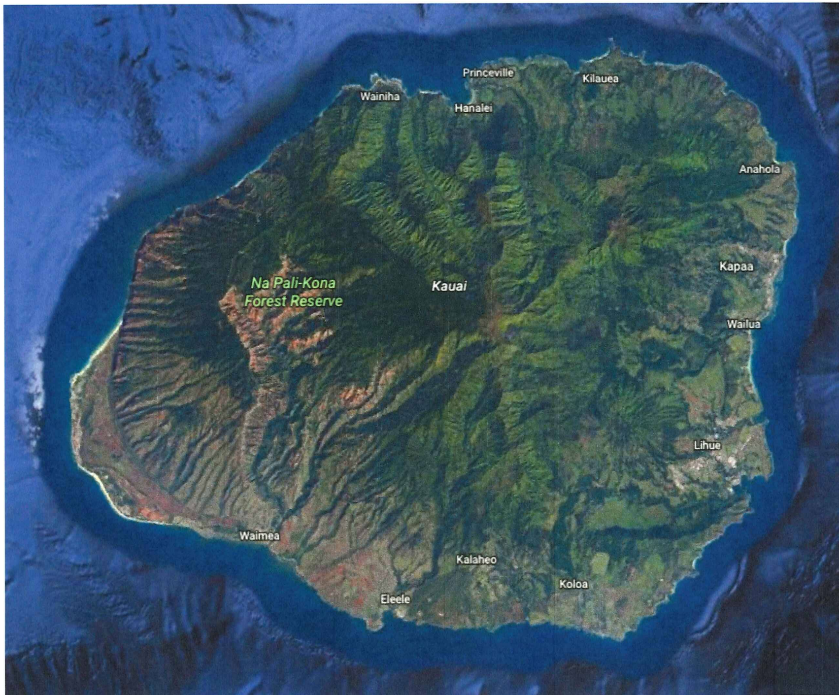
Intervenor Exhibit 1A: Kauai Satellite Photo