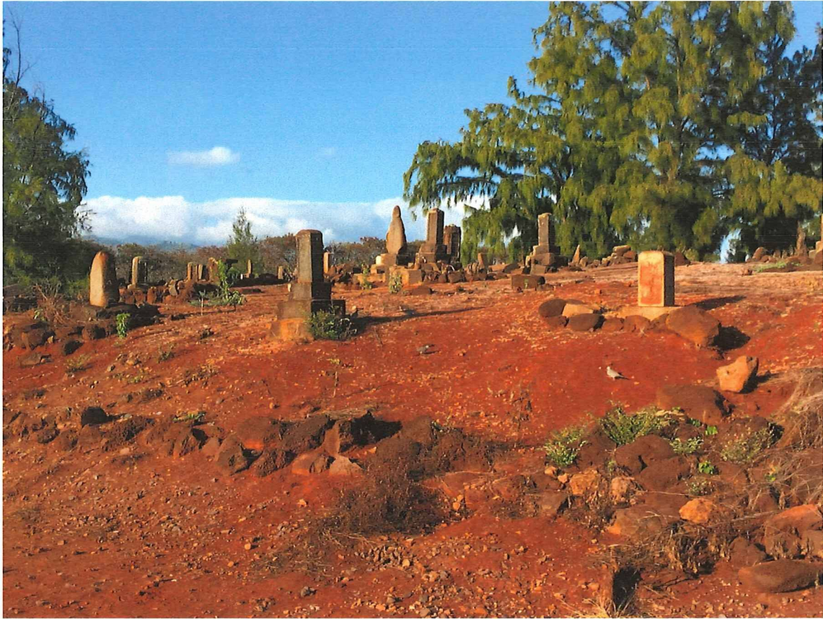
Intervenor Exhibit 10: Photo of Port Allen Cemetery, aka McBryde Cemetery (07/04/17)