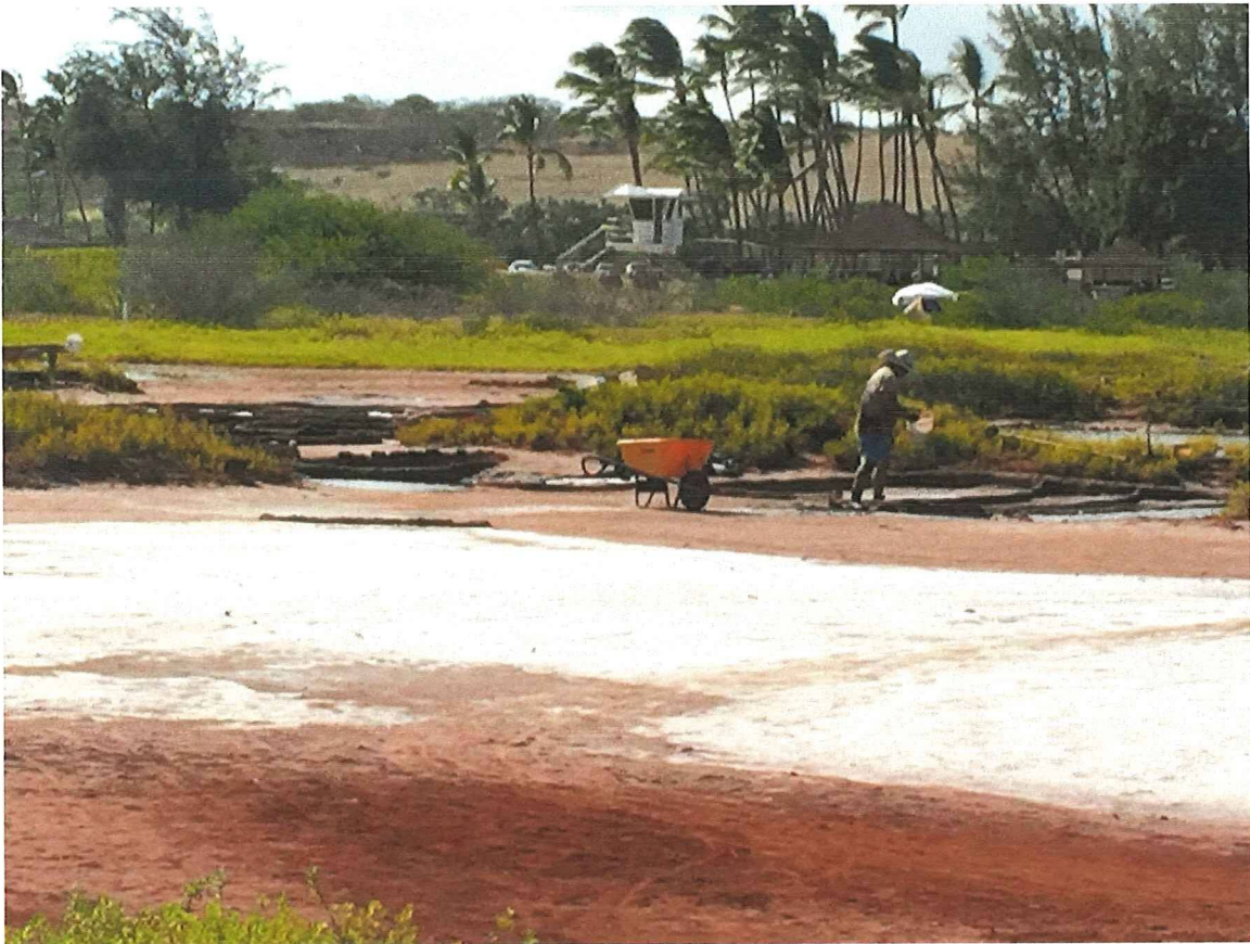
Intervenor Exhibit 5: Photo of Hanapepe Salt Pans (07/04/17)