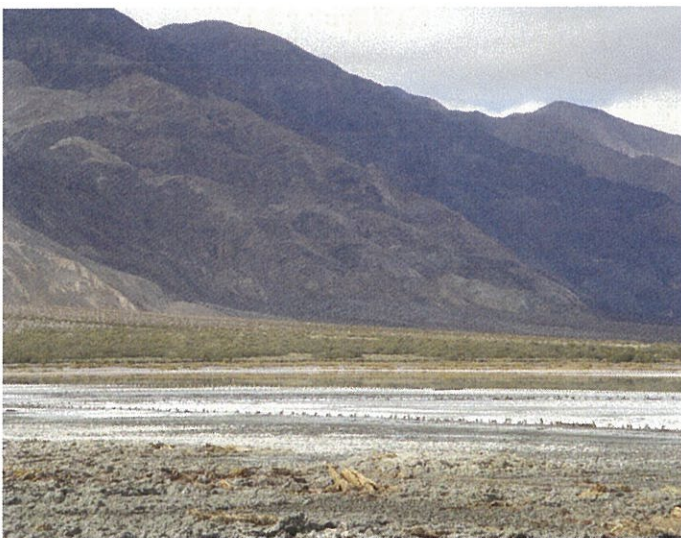
Groundwater discharge and rainfall-runoff collect and evaporate from this brackish play lake in Saline Valley, CA.