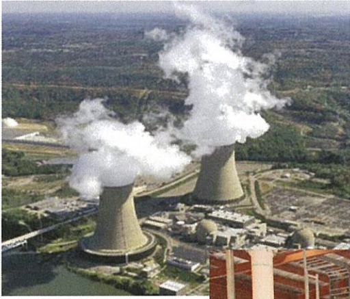
Top: Nuclear power plant cooled with brackish groundwater. Right: Brackish water desalination facility in Harlingen, Texas. The plant was built in 2007 and has a capacity of 2.25 million gallons per day.