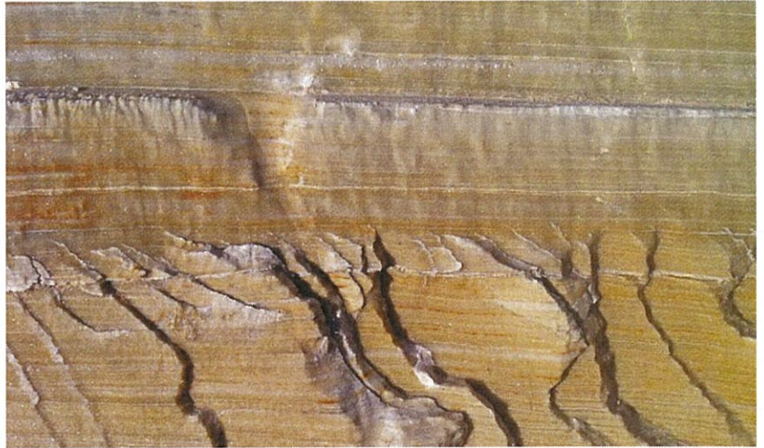
Salt deposits, such as halite or gypsum, are found in many sedimentary basins in the United States and are highly soluble. Other deposits are less soluble but can contribute dissolved solids when in contact with groundwater over longer periods of time.