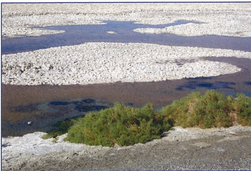
Groundwater in basin-fill aquifers of the Southwest often increases in dissolved-solids content as it travels along its flow path as a result of geochemical interactions with the aquifer matrix and through evaporative processes. At the end of its flow path, groundwater may be brackish or saline and discharges to the surface through springs such as this one in Death Valley.

Despite the need for alternative water sources and the potential availability of brackish groundwater, the most recent national map showing the distribution of mineralized groundwater was published in 1965. An updated evaluation is needed to take advantage of newer data that have been collected over the past 50 years. In addition, consistent information about chemical characteristics (such as major-ion concentrations) and hydrogeologic characteristics (such as aquifer material, depth, residence time, thickness, flow patterns, recharge rates, and hydraulic properties) of brackish groundwater has not been compiled at the national scale. Improved characterization is important for understanding and predicting occurrences in areas with few data and for assessing limitations imposed by different uses and (or) treatment options. This information is needed to understand the potential to expand development of the brackish groundwater resource and to provide reliable science for making policy decisions.