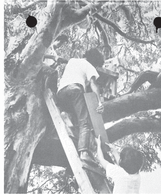
ABOVE: Where there are both trees and children, there will surely soon be a tree house.