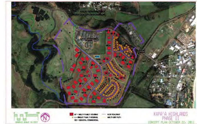
Figure 2. Kapa`a Highlands Phase II concept plan.