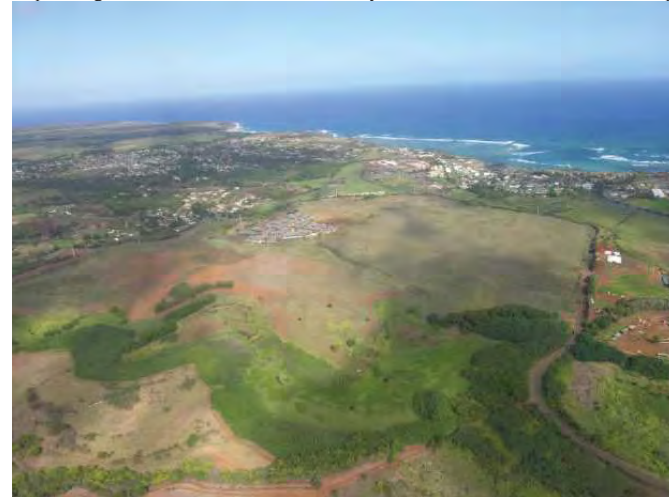
Figure 1. Aerial Image of Kapa`a Highlands Project Area.