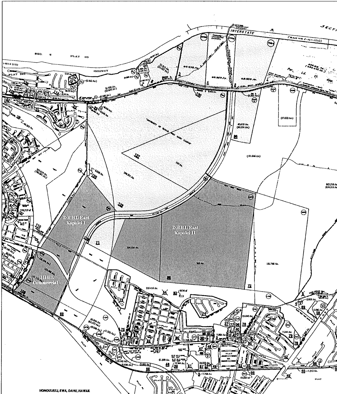
Attachment 1 Land Use Commission Docket No. A99-728, Honouliuli, Ewa, Oahu Approved Area vs. DHHL Development