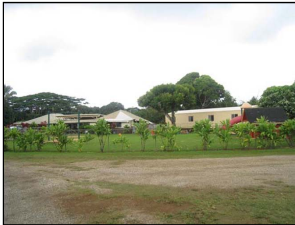
9. Punana Leo o Kauai Preschool and Kawaiki New Century Public Charter School