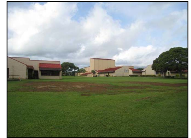
4. Center of campus facing the back of Performing Arts Center