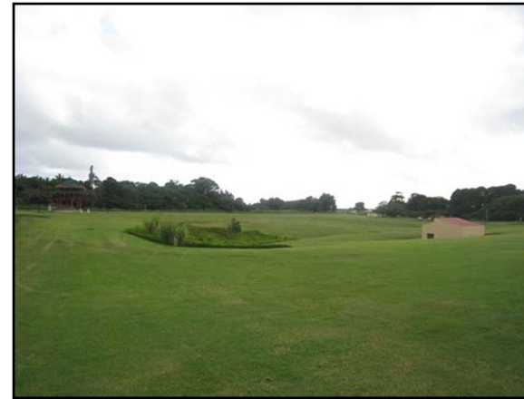
3. Detention basin/open area along the eastern portion of campus