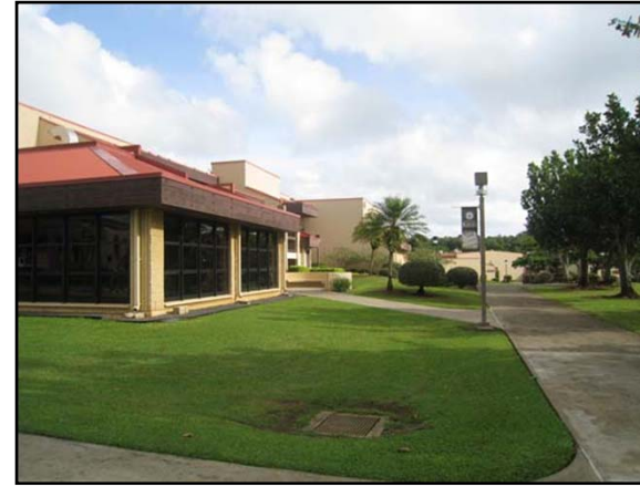
7. Campus Center