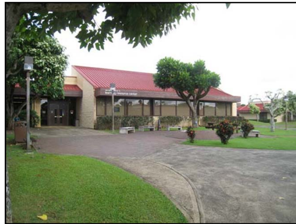
2. Learning Resource Center