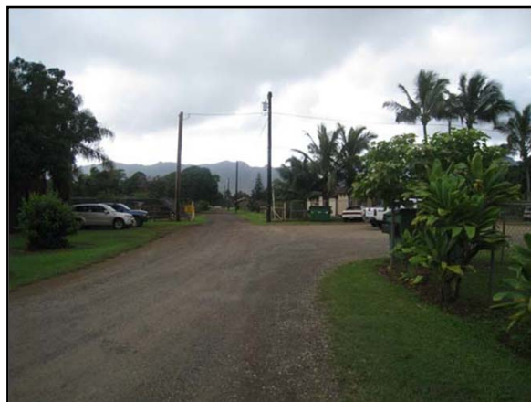
10. Access road to the agricultural fields area