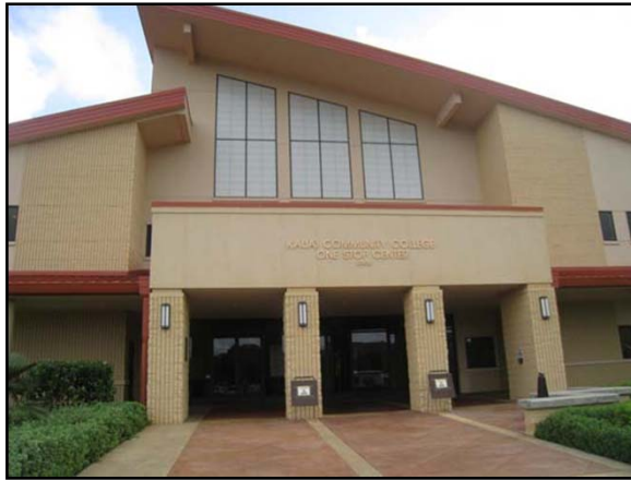
1. One Stop Center