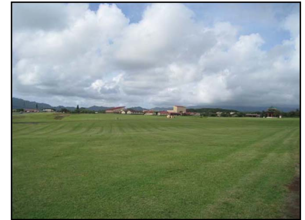
12. Detention basin/open area along the Eastern portion of campus. Facing towards the campus