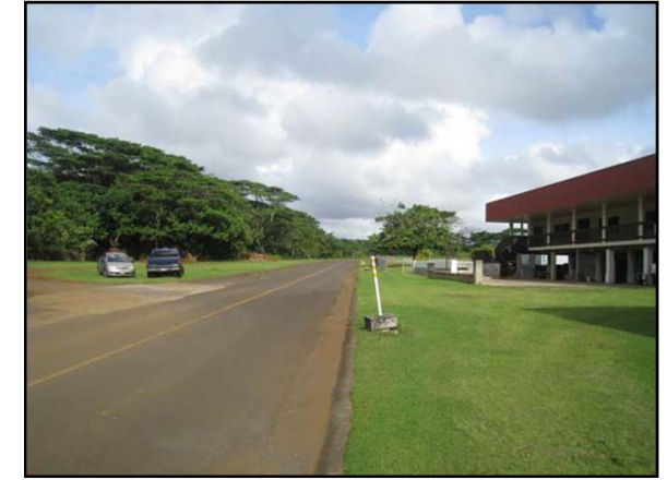
8. Access road west of the campus. Center of Continuing and Training to the right