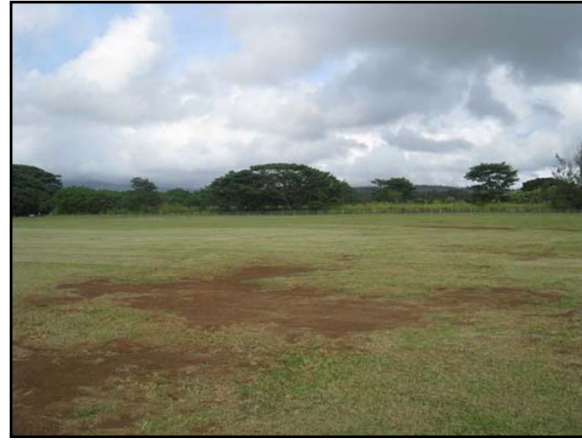
6. Open field mauka of the campus