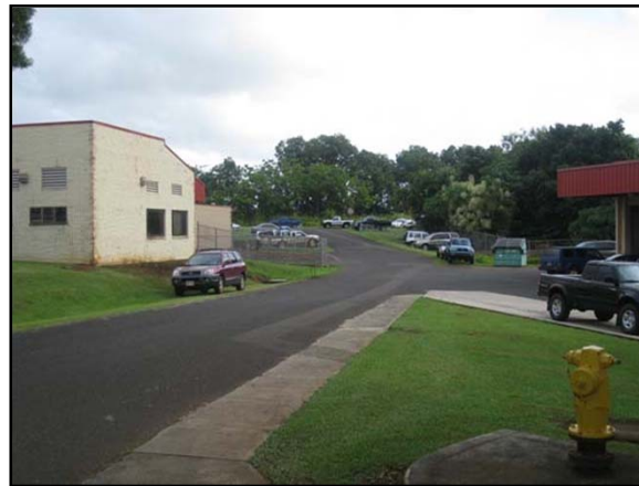
5. Access road near maintenance facility and automotive facilities