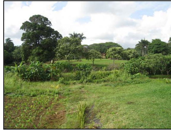
11. Loi in the agricultural fields