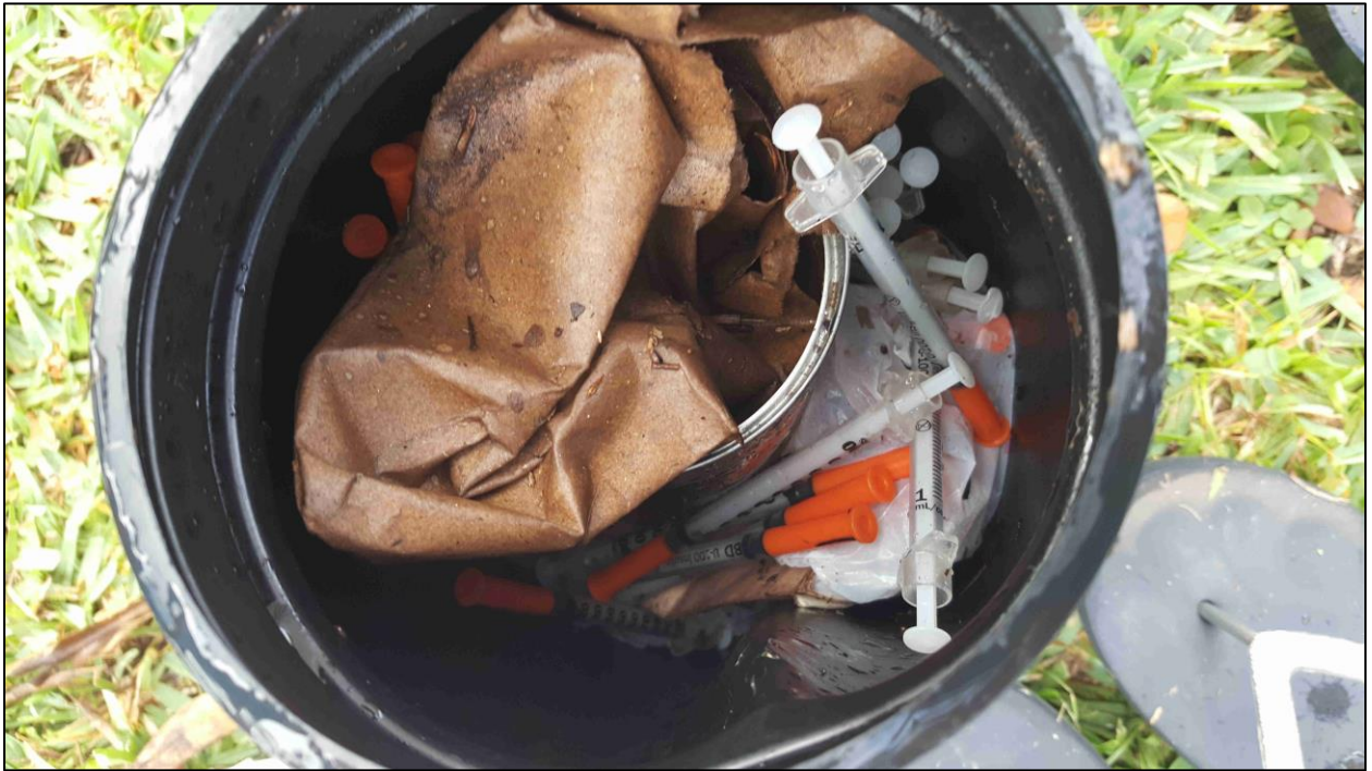
Photo #3. Hypodermic syringes gathered up from Kaua'ula Stream after recent rains.