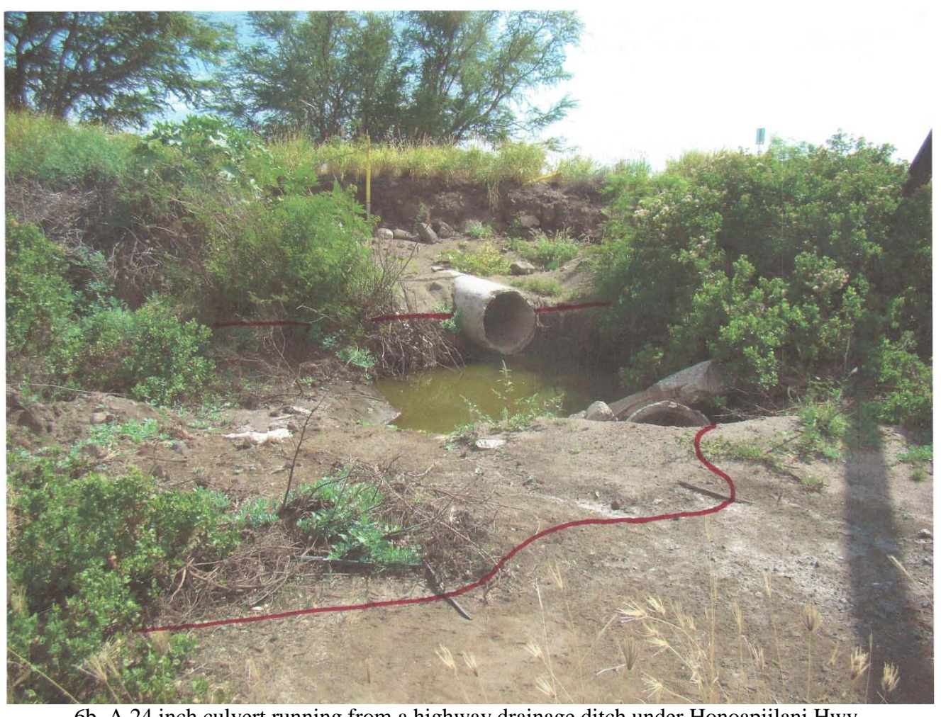
6b A 24 inch culvert running from a highway drainage ditch under Honoapiilani Hwy to the shoreline near the southern most tip of the Project.